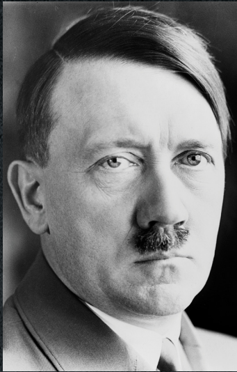
Adolf Hitler c.1932.