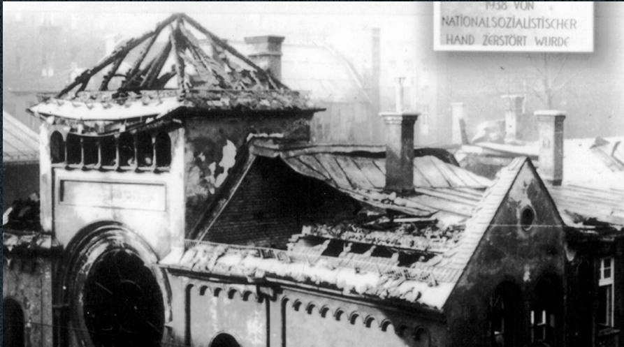
Ohel Yaakov Synagogue in Munich was one of over 200 destroyed during Kristallnacht.

The Nuremberg Laws were enacted, removing basic rights from Jews including German citizenship.