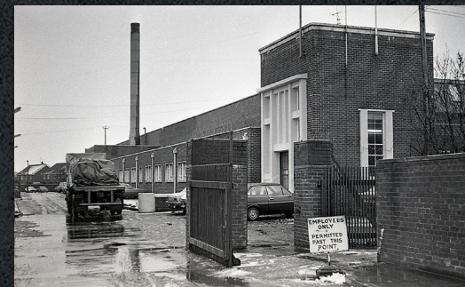
Limavady Daintifyt factory.

Notice published in Zionistische Rundschau in August 1938.