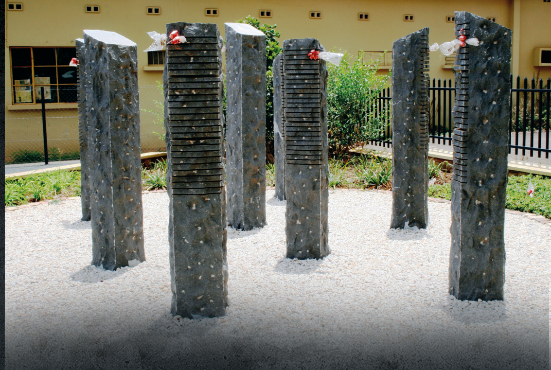
Kigali Memorial Centre.

The past holds important lessons about prejudice, hatred and the cost of remaining silent. By reflecting on these lessons, we can better understand how prejudice, discrimination and intolerance continue to affect people in the world today. We can use the learning to help build a safer, fairer and more compassionate society for the future. We all share the responsibility to recognise the warning signs, to challenge hatred in all its forms and take action against injustice.