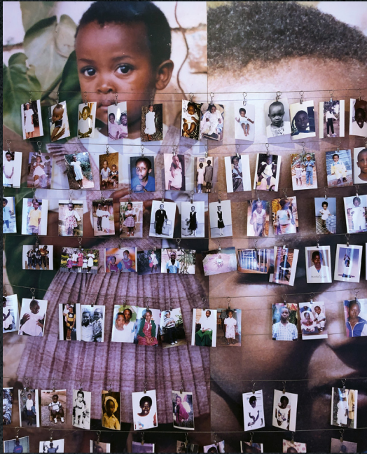
The Kigali Genocide Memorial in Rwanda is a place of remembrance, reflection and learning commemorating over 250,000 victims of the 1994 victims of the genocide against the Tutsi.

In April 1994, the assassination of the Presidents of Burundi and Rwanda ignited a genocide of Tutsis, resulting in the massacre of more than one million people. After the collapse of the moderate Hutu leadership, a committee of Hutu military leaders assumed power. The genocide was marked by extreme sexual violence with the rape of up to 500,000 women. Hutu civilians were pressured into arming themselves with machetes, clubs and other weapons and encouraged to rape, maim or kill their neighbours and steal their property. Those who refused were branded sympathisers and murdered.