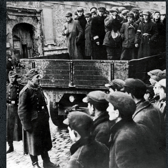
Jews being taken from the Warsaw ghetto for forced labour.

First Jewish ghetto established in Poland at Piotrków Trybunalski. The following month 380,000 Jews were contained inside the Warsaw ghetto, the largest in Europe; over 80,000 died as a result of the appalling conditions, overcrowding and starvation.