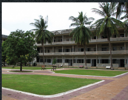
Tuol Sleng Genocide Museum, Phnom Penh. Tuol Svay Prey High School was taken over by the Khmer Rouge and used as a prison and torture chamber where prisoners were “interrogated” by Pol Pot’s security service.

Civil war had existed in Cambodia from 1970. The Khmer Rouge, a communist group led by Pol Pot, seized control in April 1975. The regime believed people had been polluted by outside influences, especially Western capitalism. Religious groups such as Christians, Muslims and Buddhists were targeted. Professions including doctors, lawyers, military or police personnel were persecuted and re-education programmes introduced to encourage a commune lifestyle.