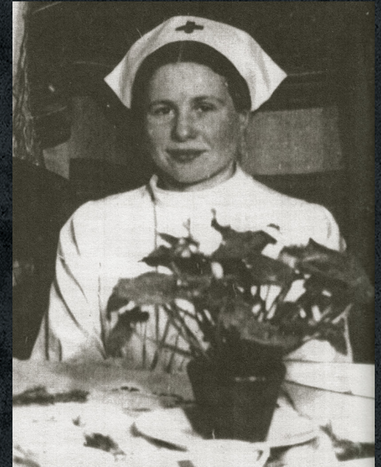
Irena Sendlerowa, December 1944.

Arrested and tortured by the Gestapo, she did not betray the children or her collaborators and was freed by a bribe from the Polish underground just before she was to be executed.