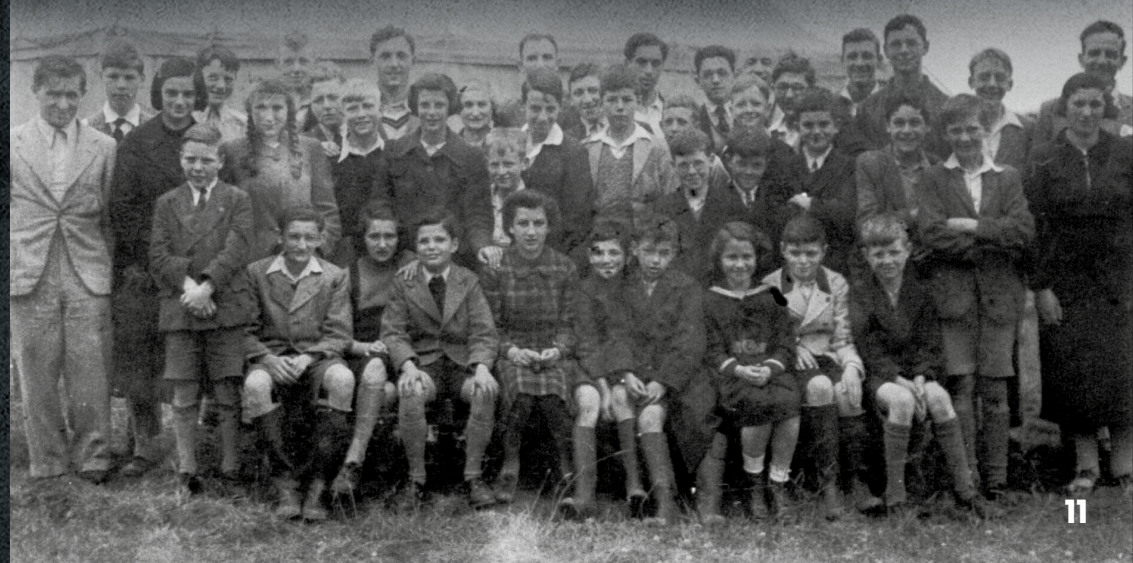
Refugees at Millisle Farm.