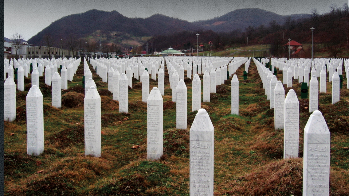
Gravestones at the Srebrenica Genocide Memorial Centre. Over 5000 of the victims of the massacre are now buried in the cemetery.

The International Court of Justice and the International Criminal Tribunal for the former Yugoslavia declared the events at Srebrenica as genocide. Over 20 individuals were prosecuted for their involvement, 16 of whom were convicted. In 2001, former Bosnian Serb General, Radislav Krstic unsuccessfully appealed his conviction claiming that the 8,000 killed was “too insignificant” a figure to be a genocide.