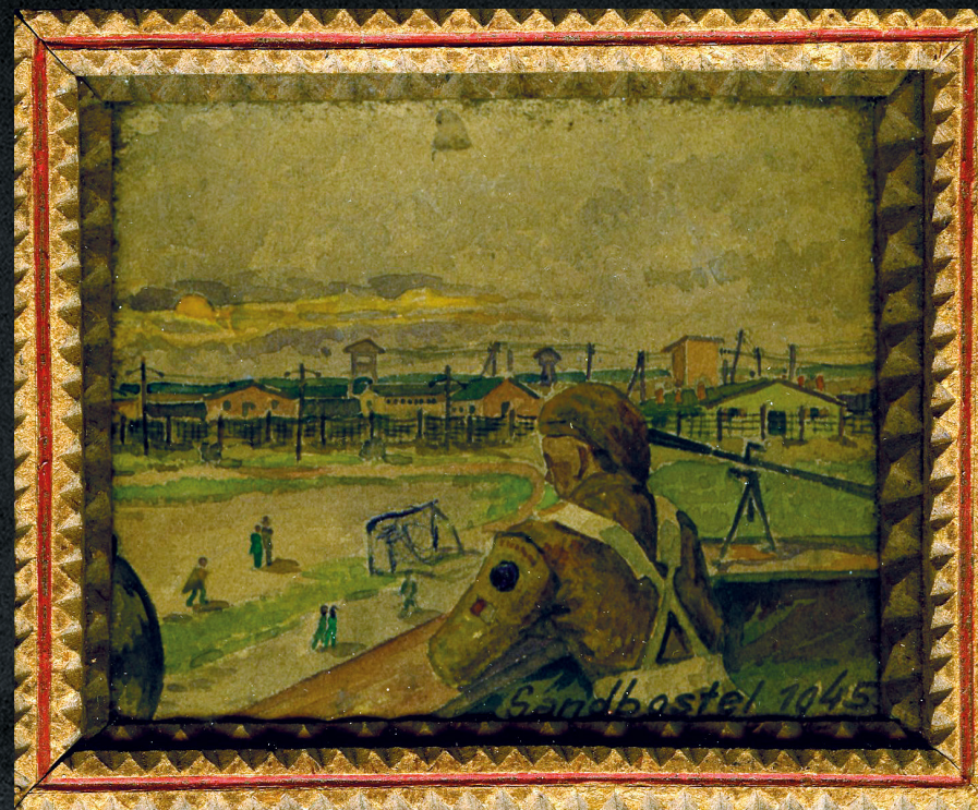
After the war, Sandbostel was used as a civilian internment camp, to house Nazi war criminals and lastly as a displaced persons camp.

In late 1939, around 200 volunteers from Coleraine and surrounding areas were enlisted into the Coleraine Battery. This group of local soldiers served in Egypt, France, Belgium, Italy and other areas. They were deployed in the Normandy landings and later took part in the final advance into Germany in 1945.