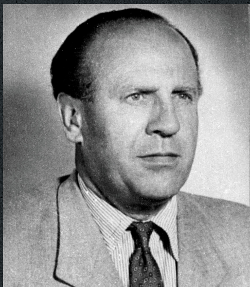
Oskar Schindler in Argentina after the Second World War.

Nicholas Winton rescued 669 children from Nazi occupied Czechoslovakia. Working tirelessly with family and friends, he met the conditions imposed by the Home Office for bringing the children to Britain. Eight trains filled with children left Prague between March and August 1939, arriving in London to be met by their sponsors. A ninth train, due to leave on 1st September, was stopped by the Gestapo and most of the 250 children on board ended up in Auschwitz.