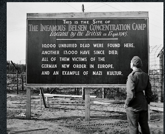
Bergen-Belsen sign erected by British troops, May 1945.

Approximately 32,000 prisoners at Dachau were liberated by United States troops on 29th April. Over 180,000 people had been imprisoned in the camp by the time it was liberated.