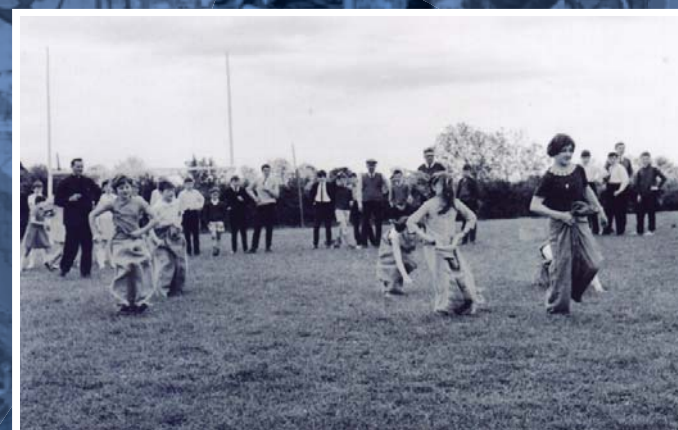
For many years, the club organised a carnival each year which was one of the highlights of the season. Athletics, children's events and entertainment were held as well as hurling and football games.