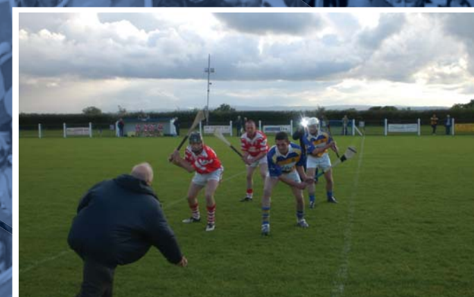
The club celebrated 100 years since the foundation of St Olcan's with a rematch of their first league game against Loughgiel