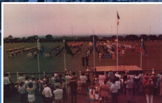
St Mary's opened their new pitch on the 31st July 1983 with a series of challenge games. The new grounds are the only ones to have hosted a Senior Antrim County Football final other than Casement Park.