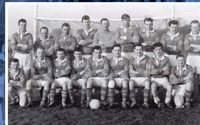
Between 1959-1965 St Mary's were one of the leading football sides in Antrim. Although unable to capture the elusive County Championship, they won promotion from Division Two of the league and multiple South West Antrim Championships.