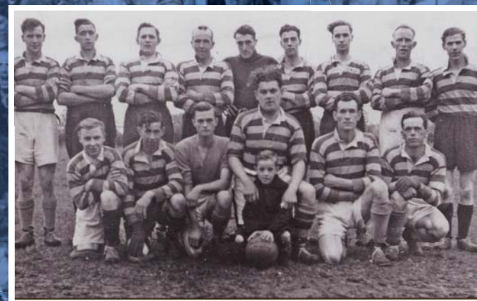
St Mary's footballers in their first full season, 1944. This side would go on to win the new club's first trophy, the McCotter Cup, the following season.