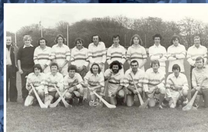
Hurling was reintroduced to St Mary's in the 1970s. They won the Guardian Cup in four out of five seasons between 1977-1981 but were unable to replicate this form in the County Championship.