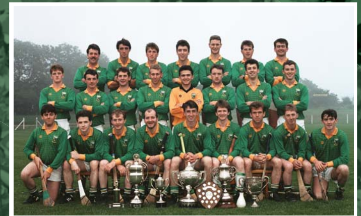
1990 was the breakthrough year for Dunloy's hurlers as they won nearly every competition they entered including their first County and Ulster Championships.