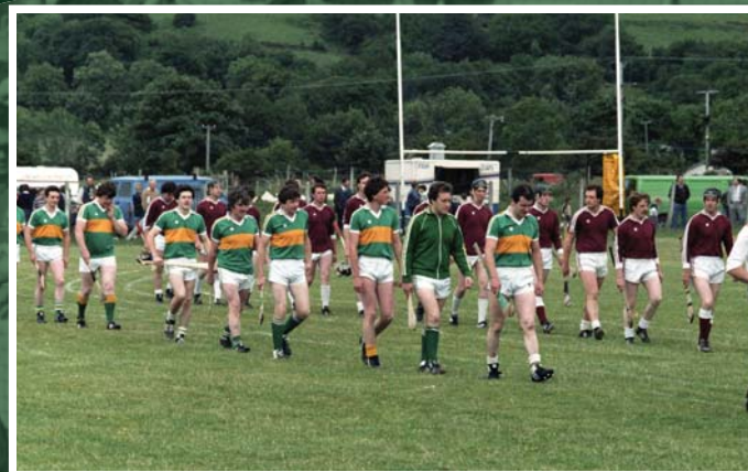
Dunloy met Cusendall in the final of the Centenary Cup at Loughgiel, a one off trophy to celebrate the 100th Anniversary of the G.A.A.