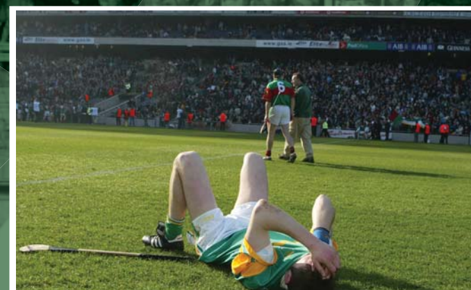
Heartbreak again as Dunloy fall in the All-Ireland final 1-19 to 0-11 against Birr in 2003. They had made history by becoming the first team from Ulster to defeat a club from each province in the All-Ireland Club Hurling Championship.