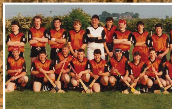
St Brigid's line up for the first time in 1992. During the club's early years training sessions took place in the fields of local farmers.