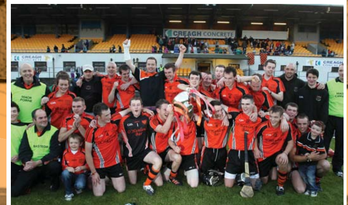
St Brigid's celebrate their County Antrim Intermediate Championship win 2012, completing a remarkable rise through the ranks. For their Senior debut they played Loughgiel in the Championship for the first time in their history.