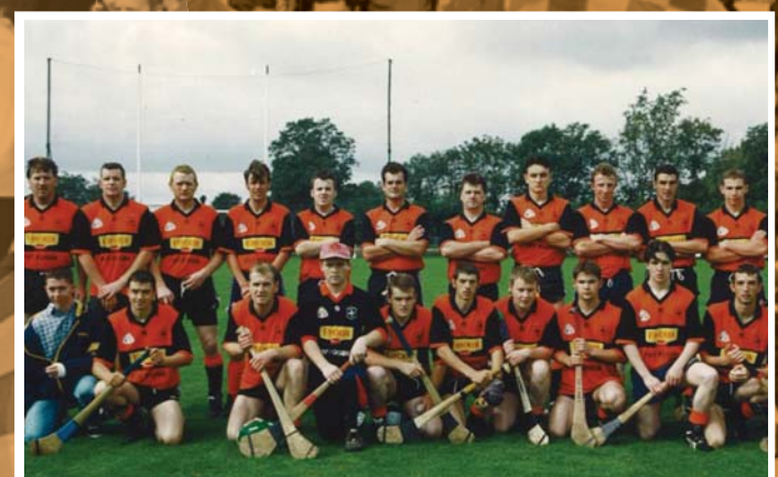
St Brigid's line up before their first County final in 1997.