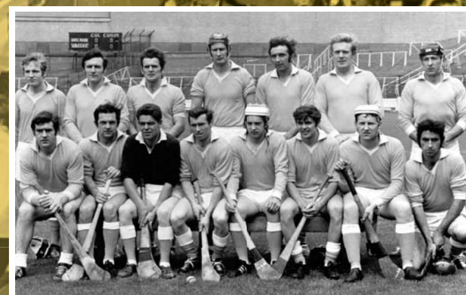
Antrim defeated Warwickshire 4-18 to 3-06 at Croke Park in 1970 to win their first All-Ireland hurling trophy, the Intermediate Championship.