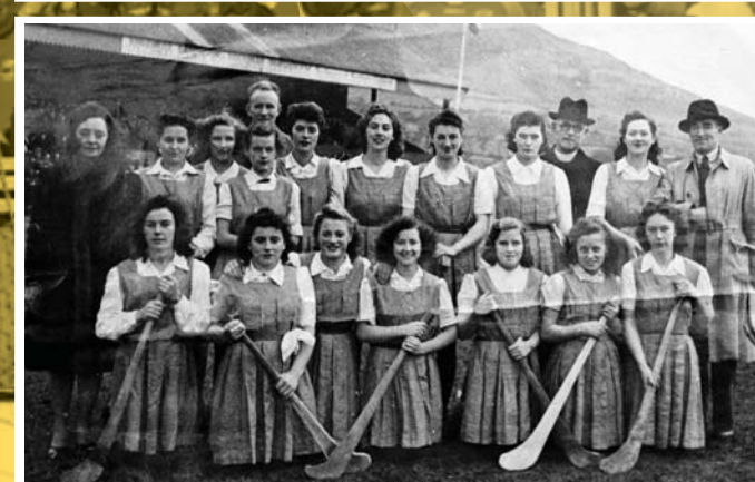
Antrim won two of their famous three in a row at Corrigan Park in Belfast. They were only the third county to win the O'Duffy Cup since its formation in 1932.