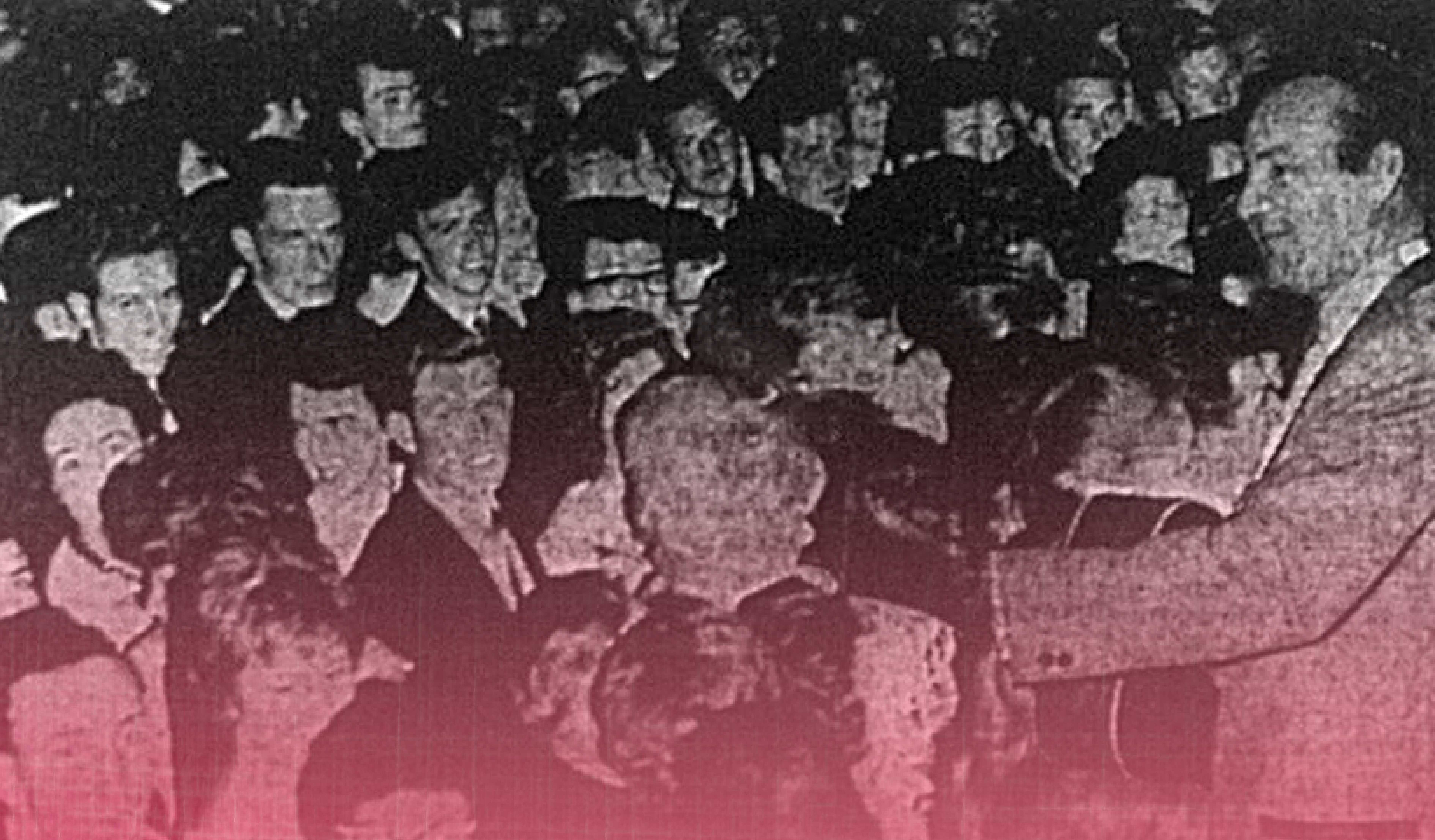
Jim Reeves on stage at the Flamingo Ballroom.

On a typical Saturday night at the Strand Ballroom three bands played. First on stage was an up and coming local band such as the Beltona Showband, or the Delta All-Stars, who were paid around £5. The support act followed, paid between £5 and £85, depending on popularity and crowd size. The headline act would go on stage around 11pm, some even later if they were playing another venue beforehand. Usually headline acts only performed for 30 to 50 minutes, in contrast with a typical 90 minute set today.