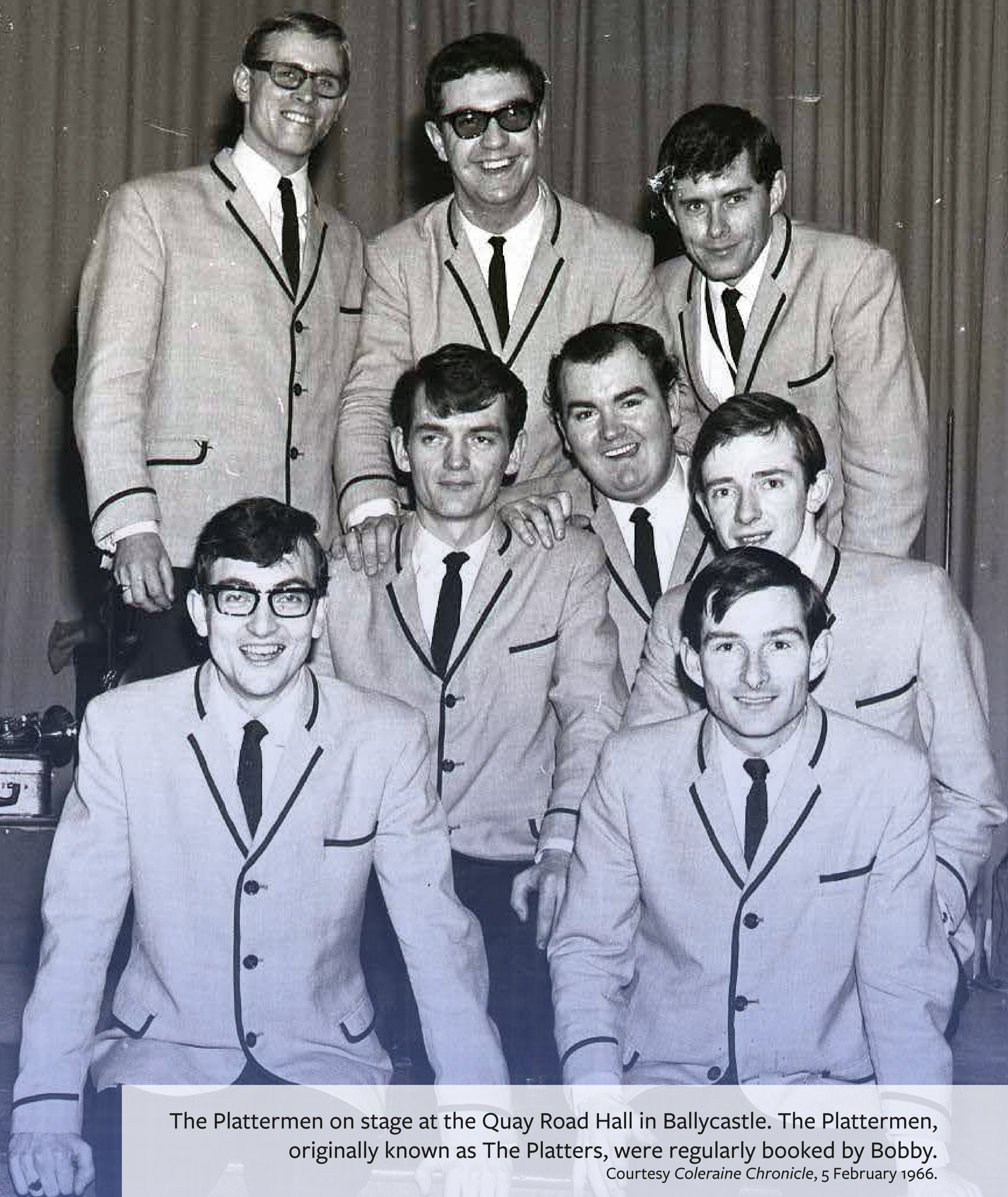
The Plattermen on stage at the Quay Road Hall in Ballycastle. The Plattermen, originally known as The Platters, were regularly booked by Bobby. Courtesy Coleraine Chronicle, 5 February 1966.

Musicians regularly moved between showbands, and often solo touring artists were supported by local showbands while on tour.