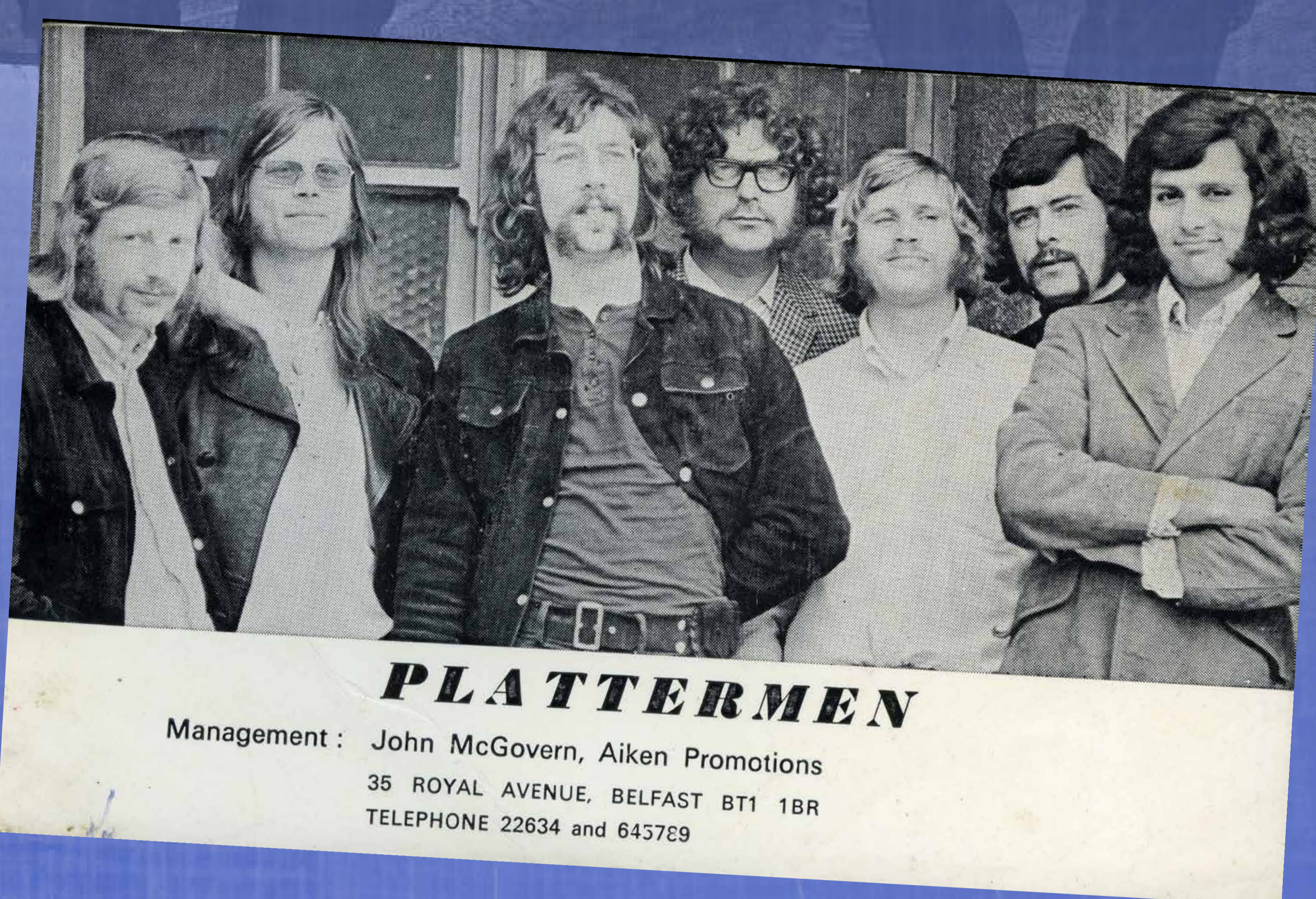
Promotional photo of The Plattermen from 1967 with longer hair styles and modern dress. This style update led to threats of demonstrations if the band appeared in the North Coast area.