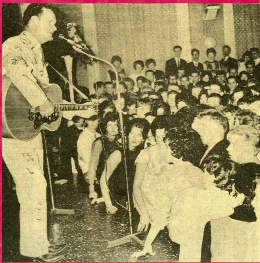
Hank Locklin on stage at the Strand Ballroom.

Hank was an American country singer-songwriter. He played at the Strand Ballroom in 1963 and 1967, and Limavady in 1964 and 1966. Appearing at the Strand Ballroom he said, ‘If I can go out there tonight, and even make just one person happy, then I’ll be happy.’ (Northern Constitution, 14 September 1963).