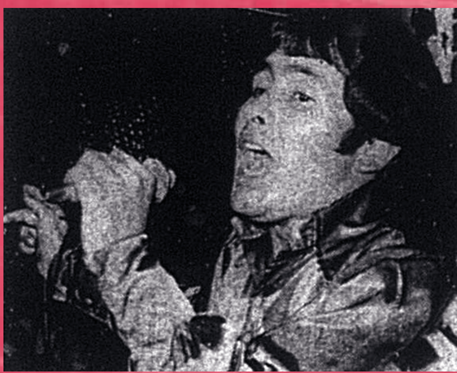
Reg Presley on stage at the Strand Ballroom. Courtesy Coleraine Chronicle, 11 February 1967.

The Troggs had reached number 2 in the UK charts with Wild Thing , and number 1 with With a Girl Like You , when they played the Strand Ballroom on 2 February 1967.