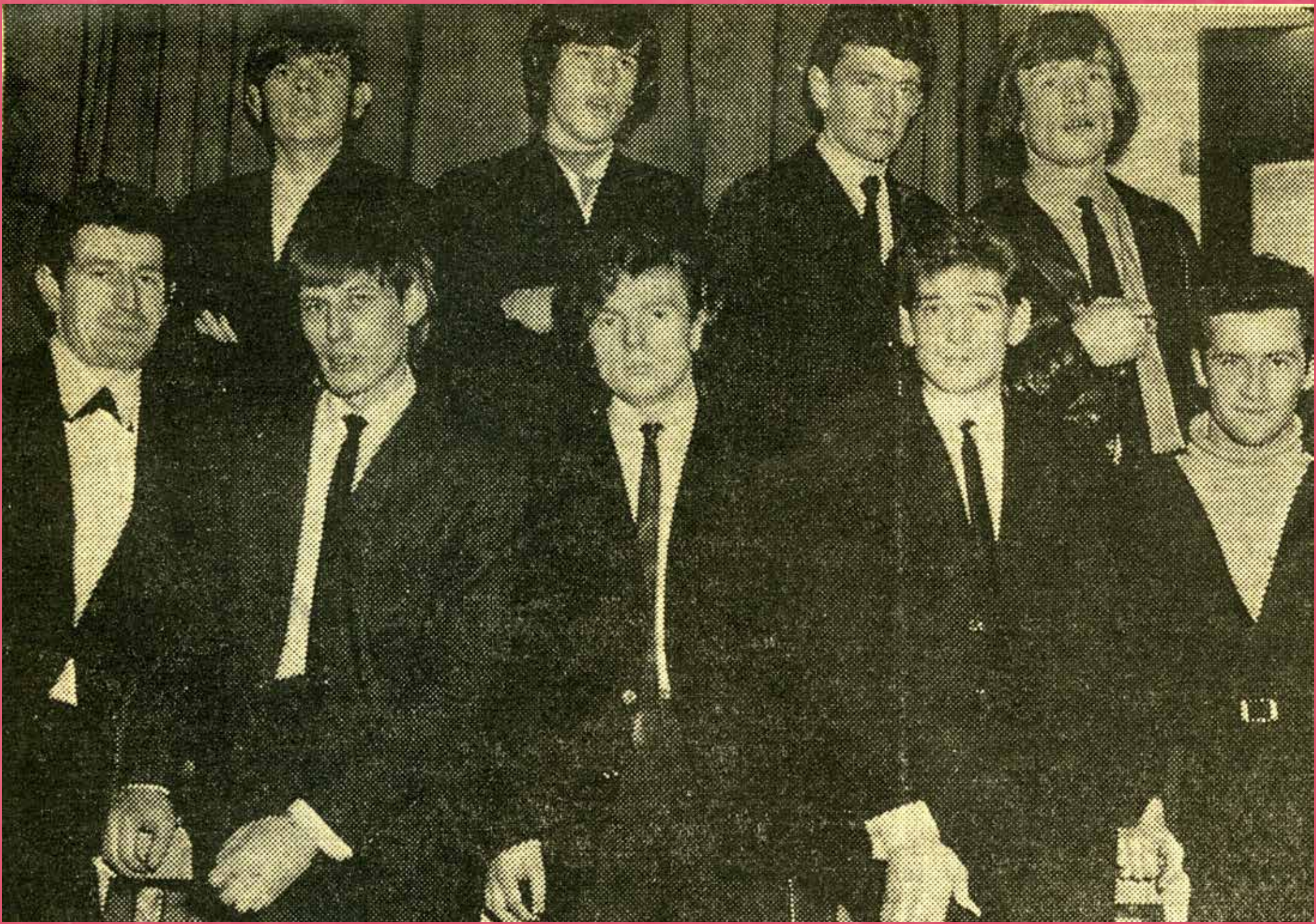
Members of Pacific Showband and Them.