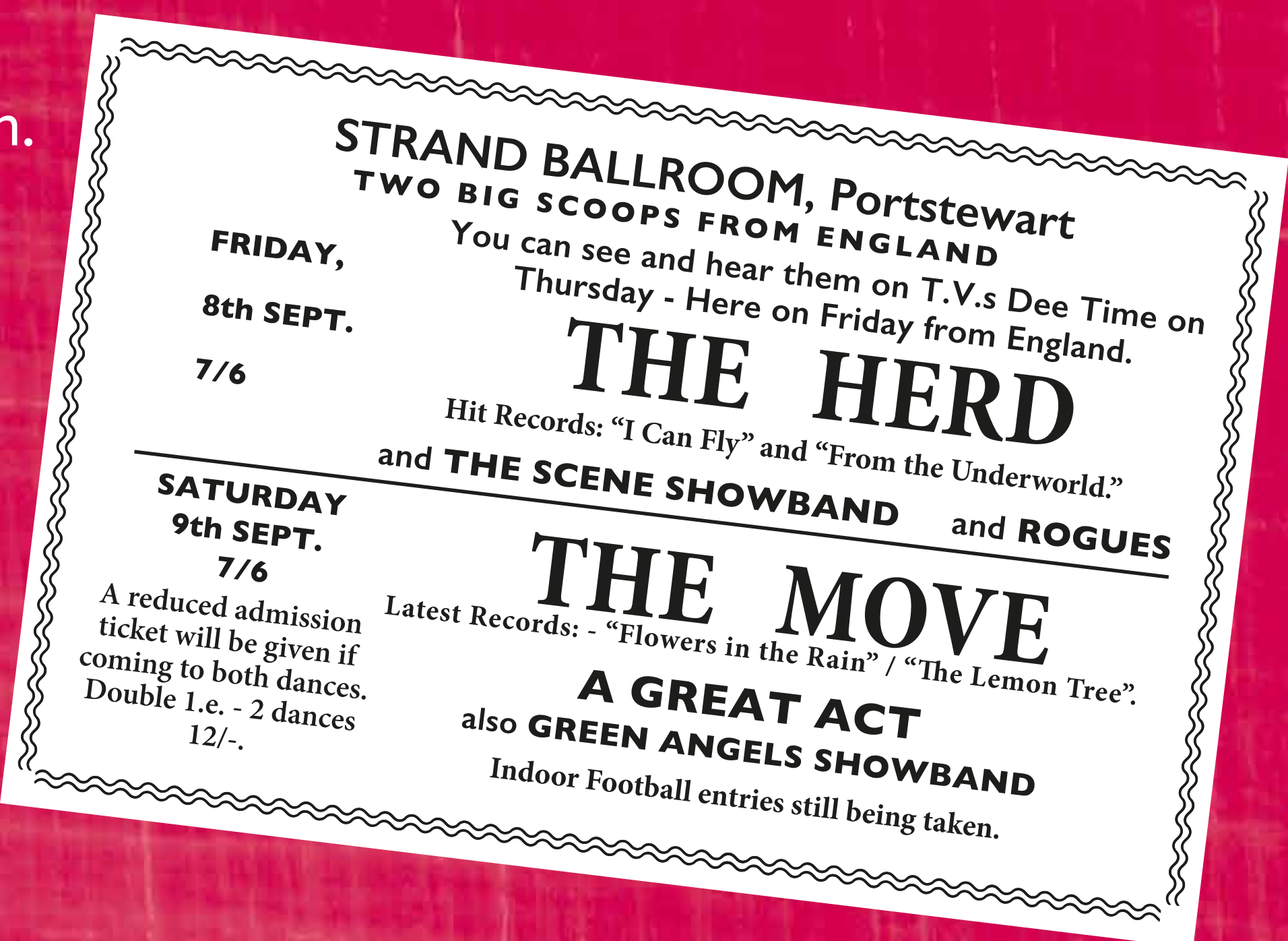
Advertisement for the Strand Ballroom. Courtesy Coleraine Chronicle, 9 September 1967.

The Move played the Strand Ballroom on 9 September 1967, after their single Flowers in the Rain was the first song played on BBC Radio 1. The band line-up included Roy Wood, later of Electric Light Orchestra and Wizzard.