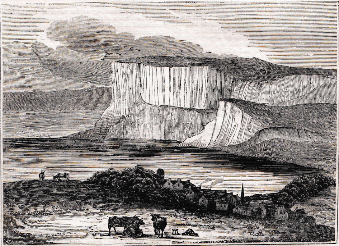
VIEW OF FAIRHEAD.

THE following is an account of an island little known to tourists, but possessing much to interest the curious traveller, and affording ample scope for the exercise of their several talents to the botanist, the geologist, the painter, the ornithologist, and the general lover of natural history.