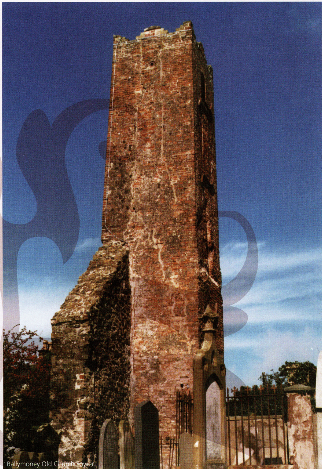
Ballymoney Old Church Tower.