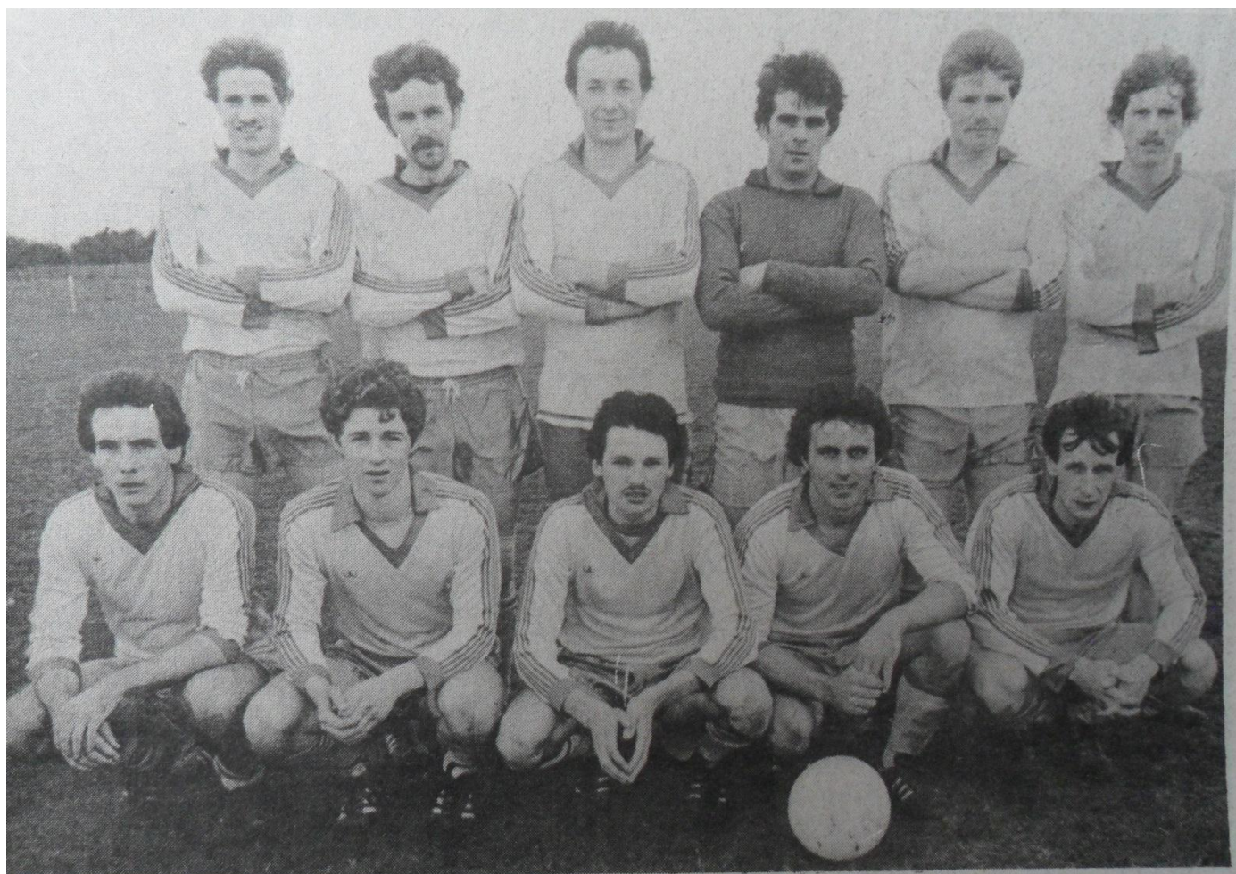
Roe Valley Reserves, who were beaten by Park. The Reserves finished fifth in the league.