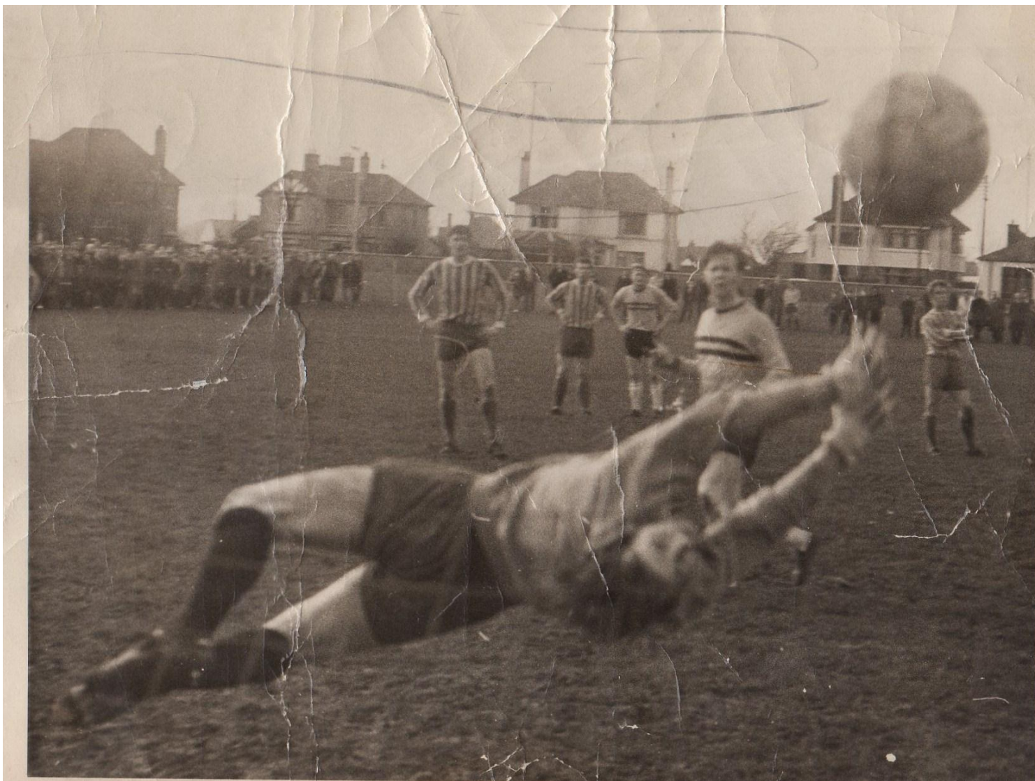
Action shot from the high profile friendly against Coleraine in 1970, the legendary Bertie Peacock came out of retirement to play for the Bannsiders