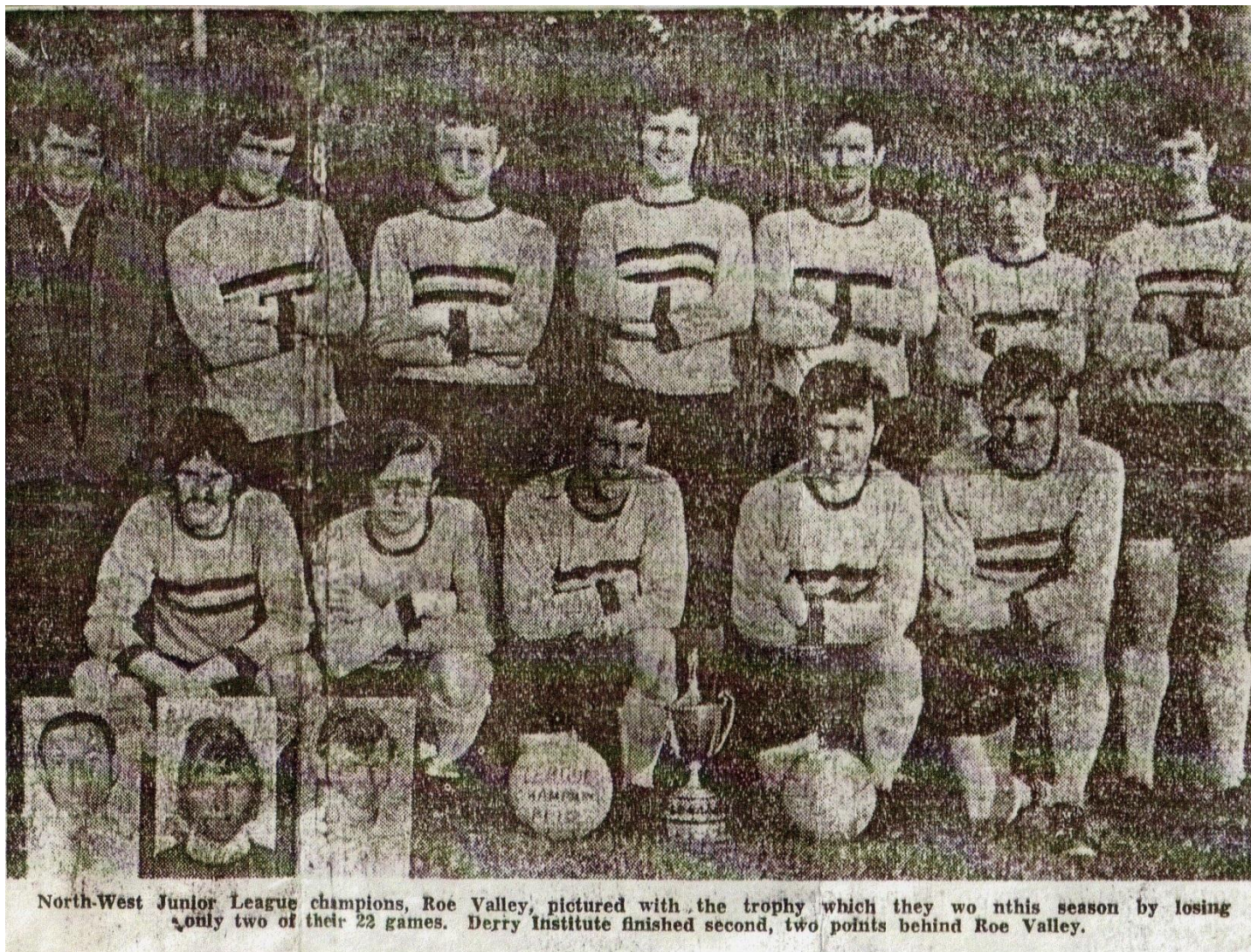
Roe Valley F.C. 1970-71 N.W. 1st Division Champions for the first time