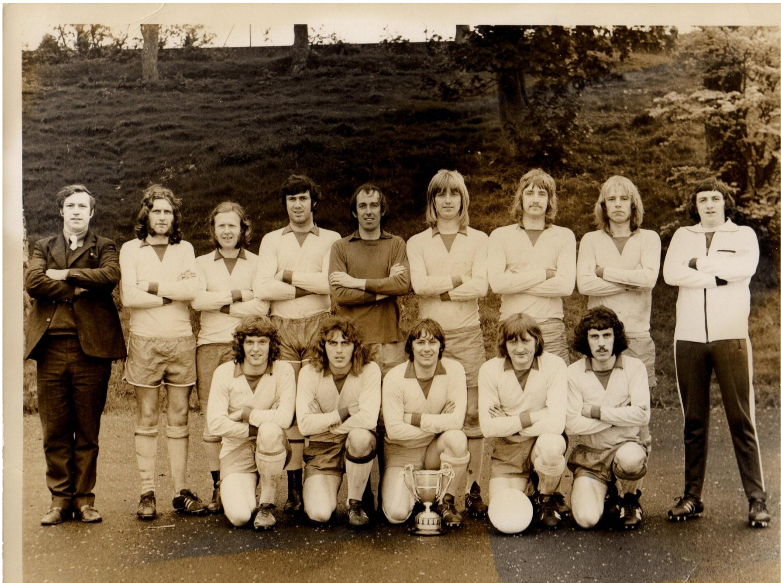
Roe Valley F.C. City Cup Winners 1973-74