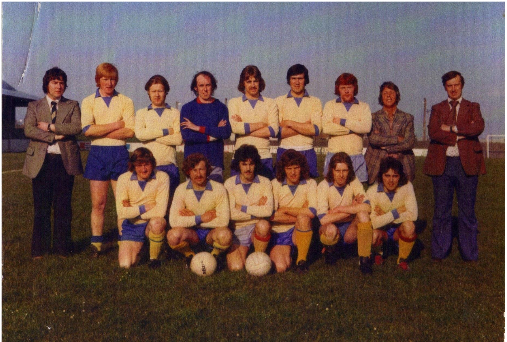
Roe Valley F.C. 1973