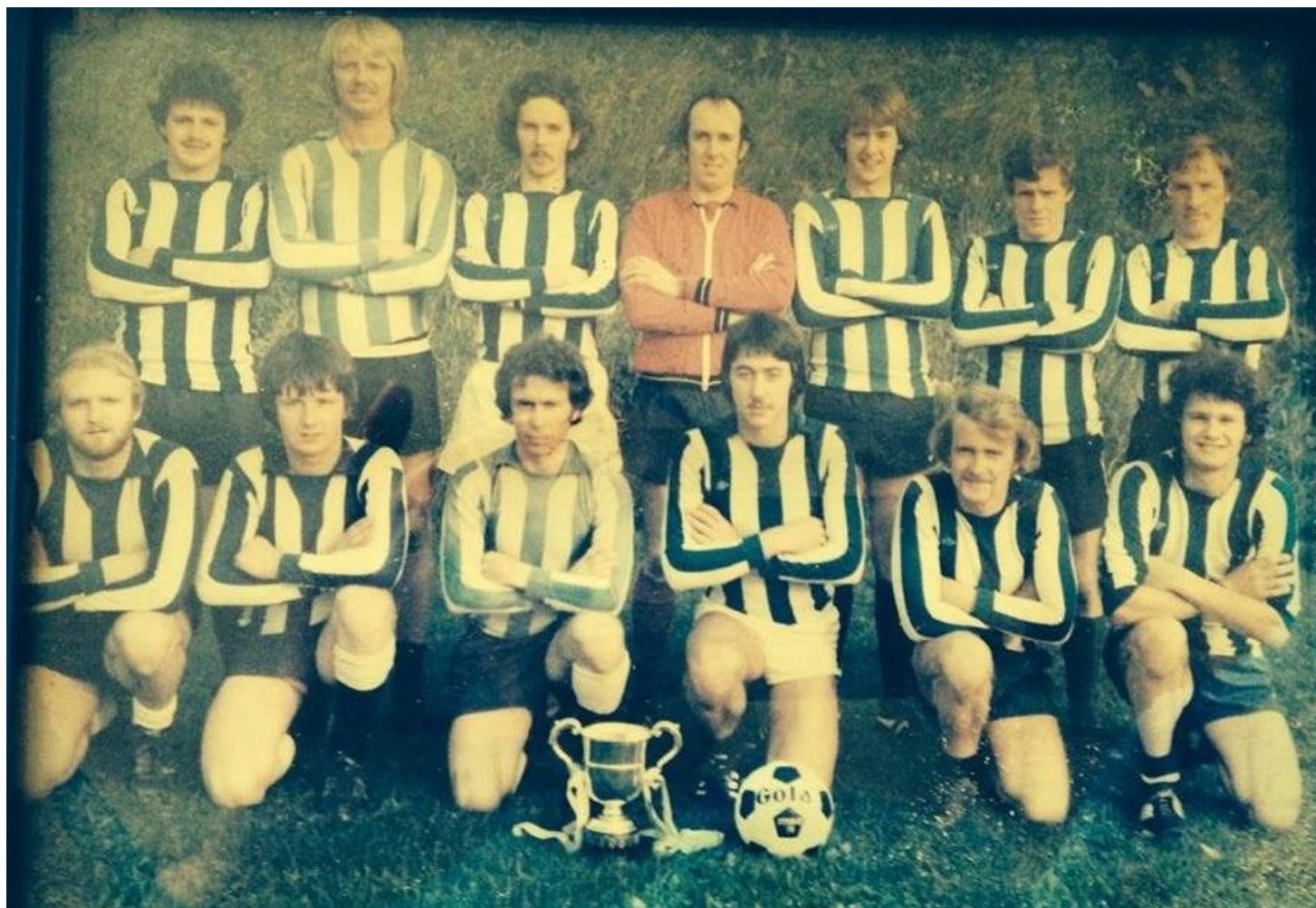
Roe Valley Reserves N.W. 2 nd Division Champions 1977-78