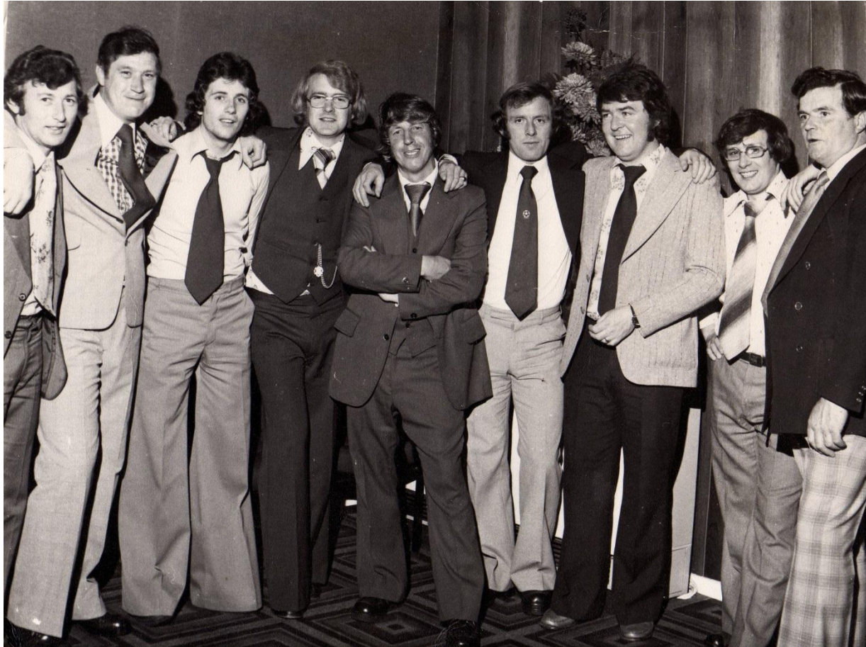
Players Presentation Night Mid 1970's