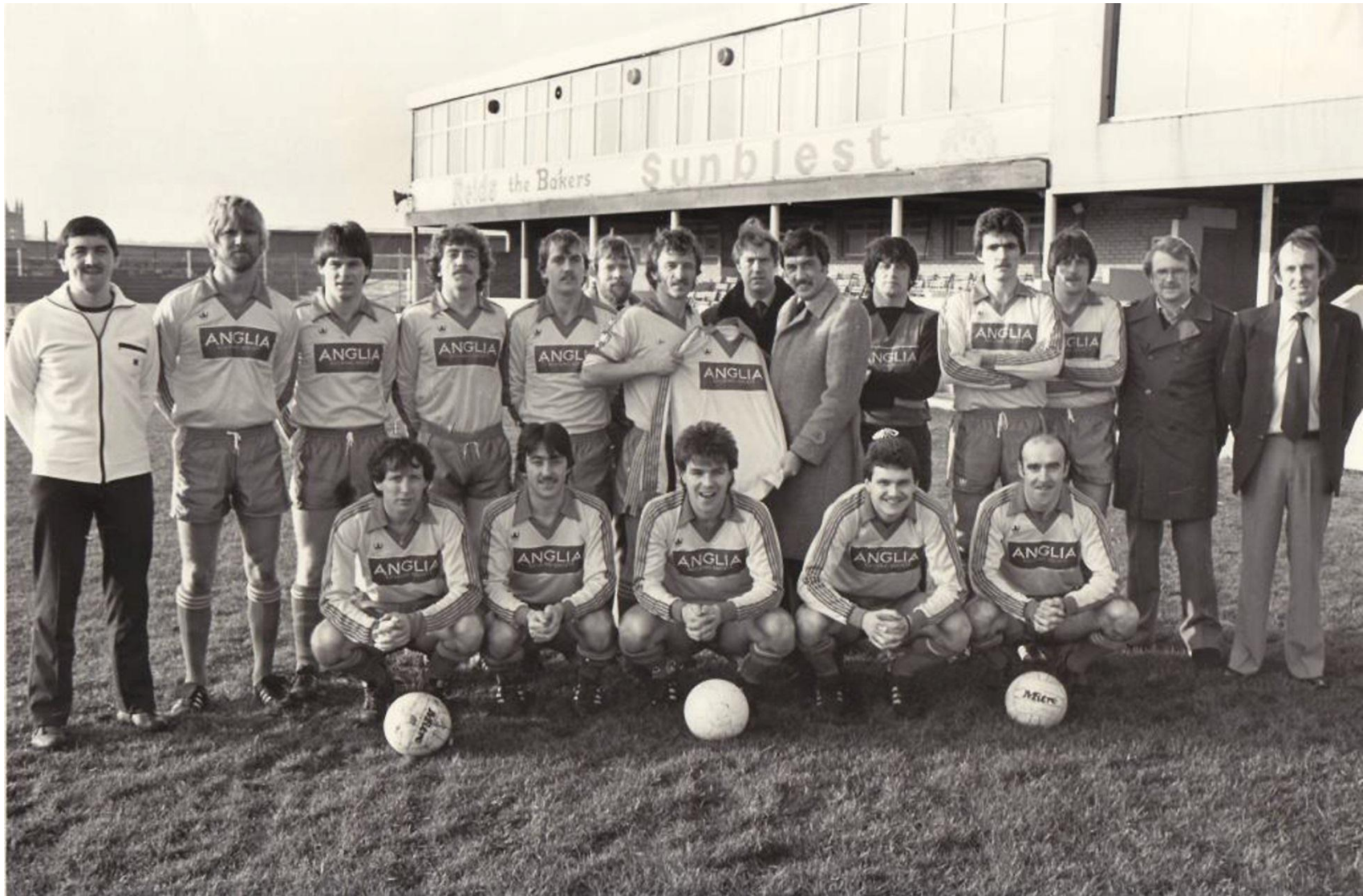
North West Intermediate Cup Winners 1982-83. Roe Valley beat Institute in the final played at the Coleraine Showgrounds