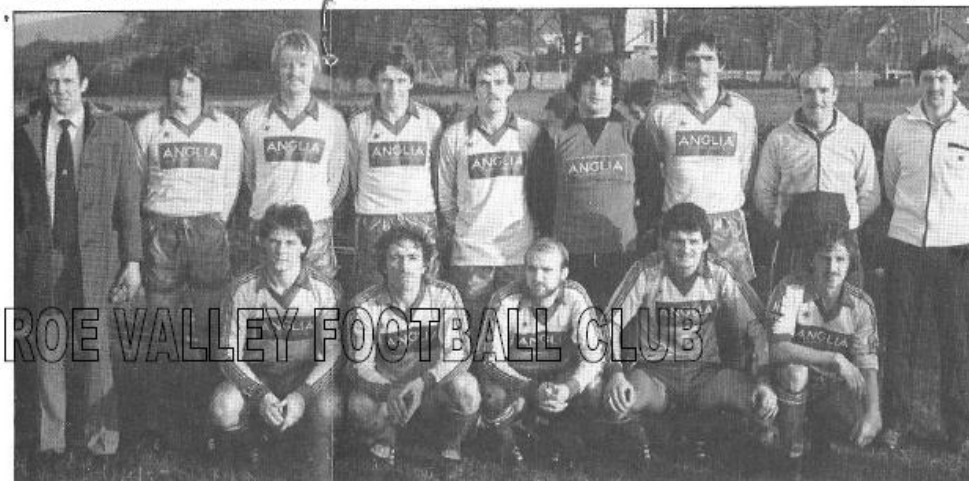
Roe Valley Football Club, Linfield's Intermediate League opponents in the Irish Cup today.

There are faces in Valley's line-up today