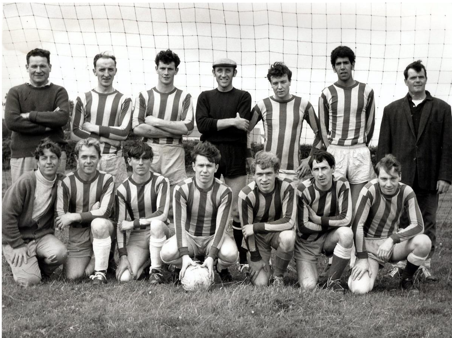
Roe Valley F.C. 1966