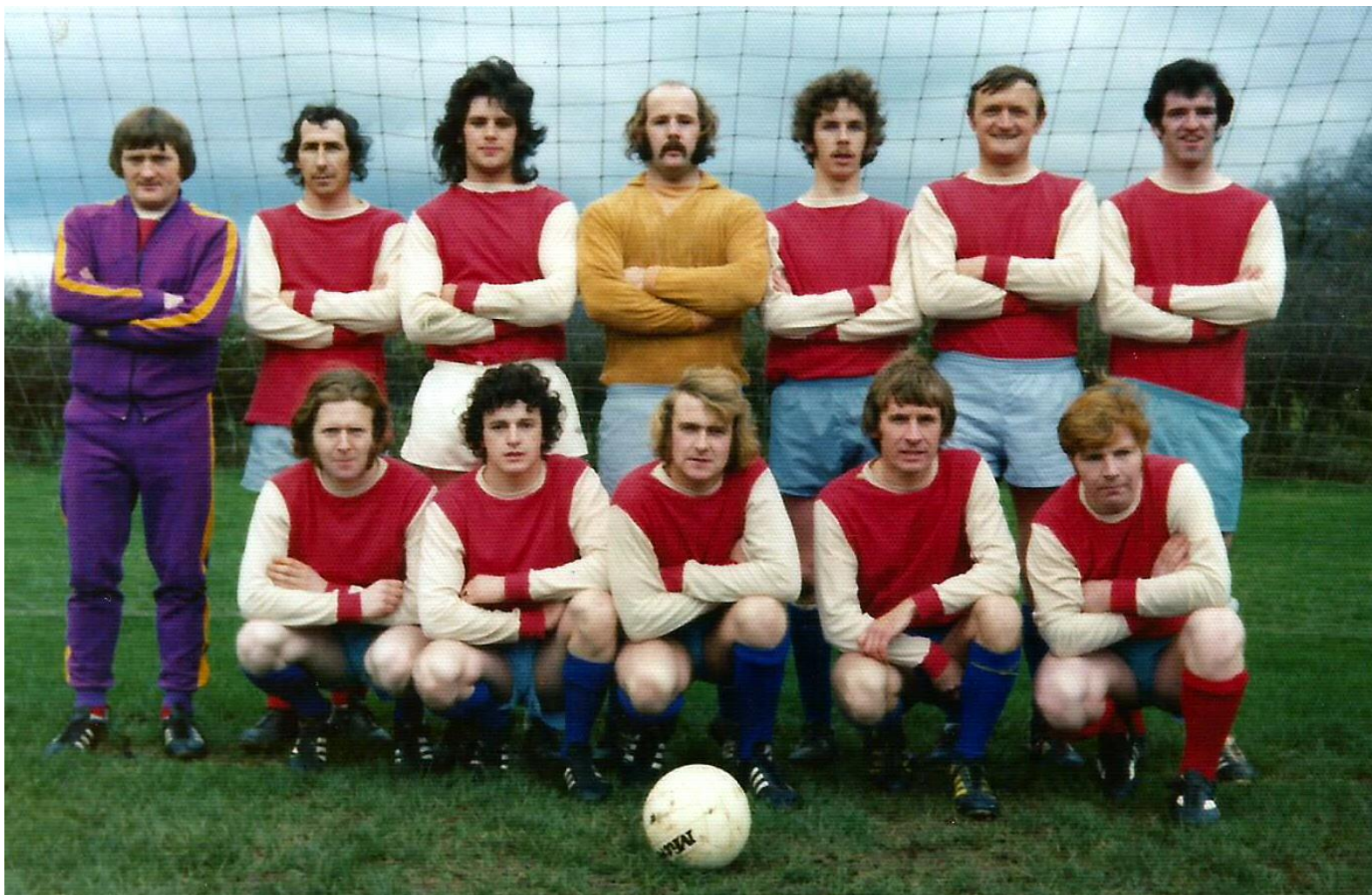
Roe Valley Reserves 1974-75