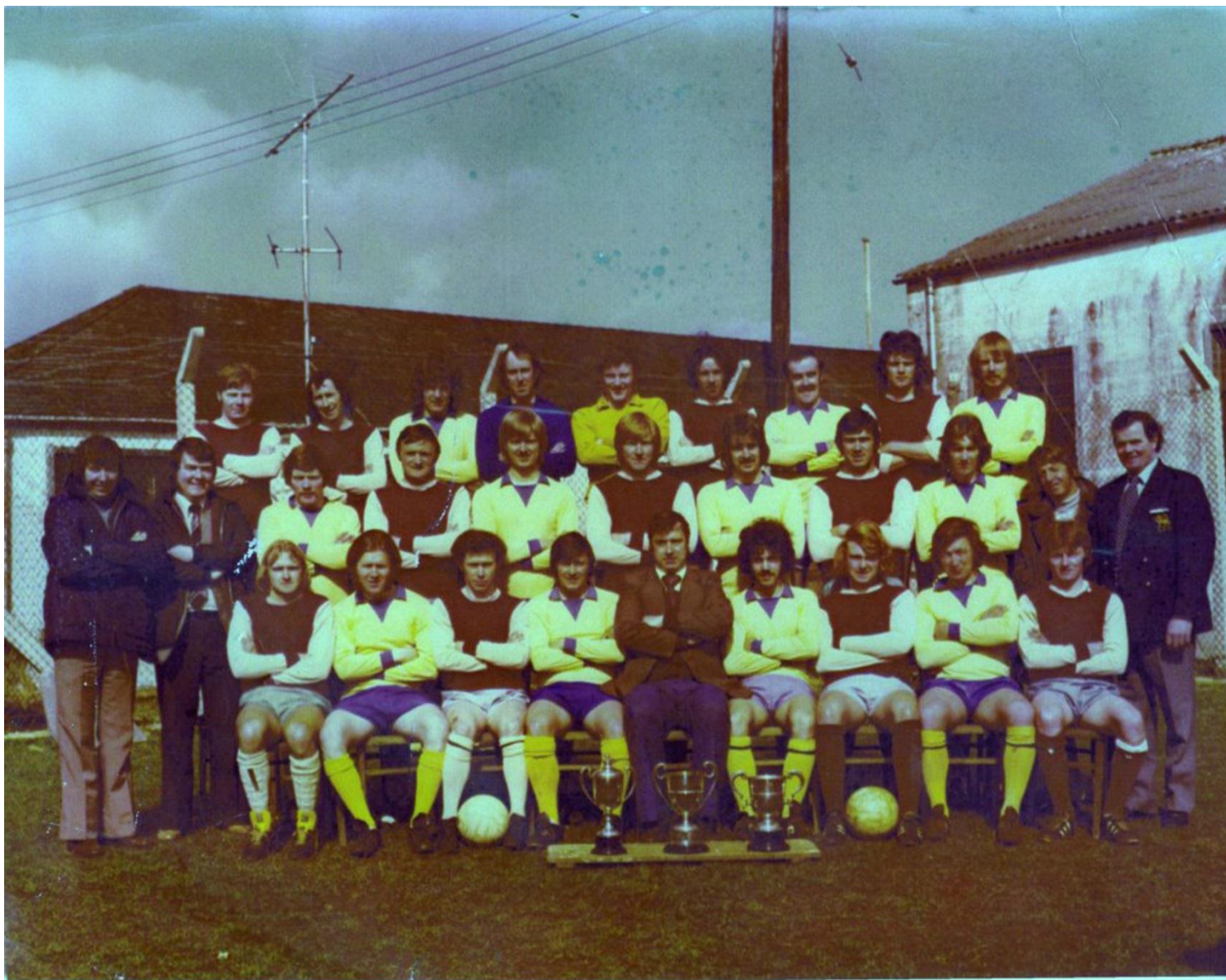
Roe Valley F.C. 1974-75 Treble Winners- First Team won the N.W. Junior League 1st Division and N.W. Junior Cup and the Reserves won the City Cup beating the first team in the final