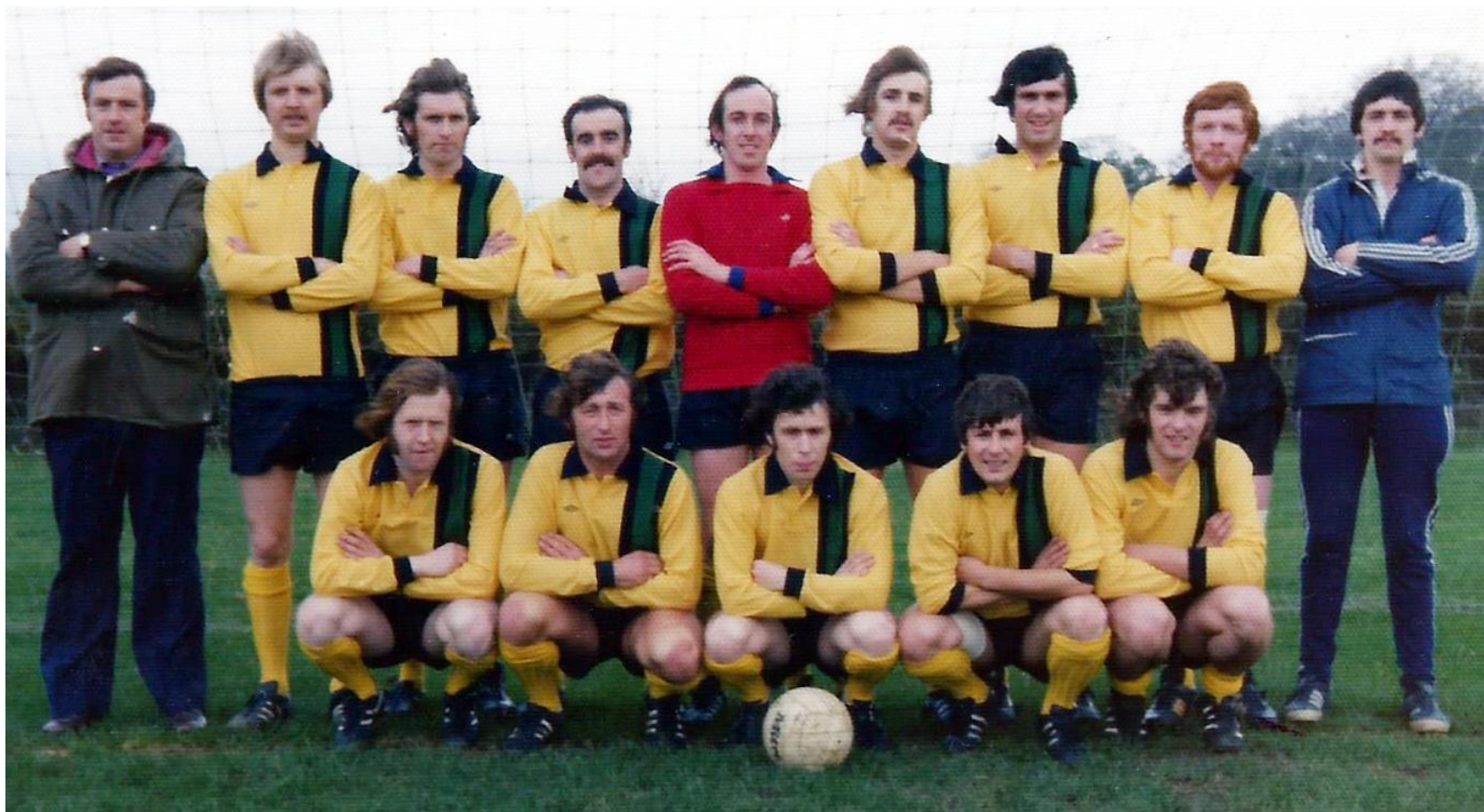
Roe Valley First Team 1975-76