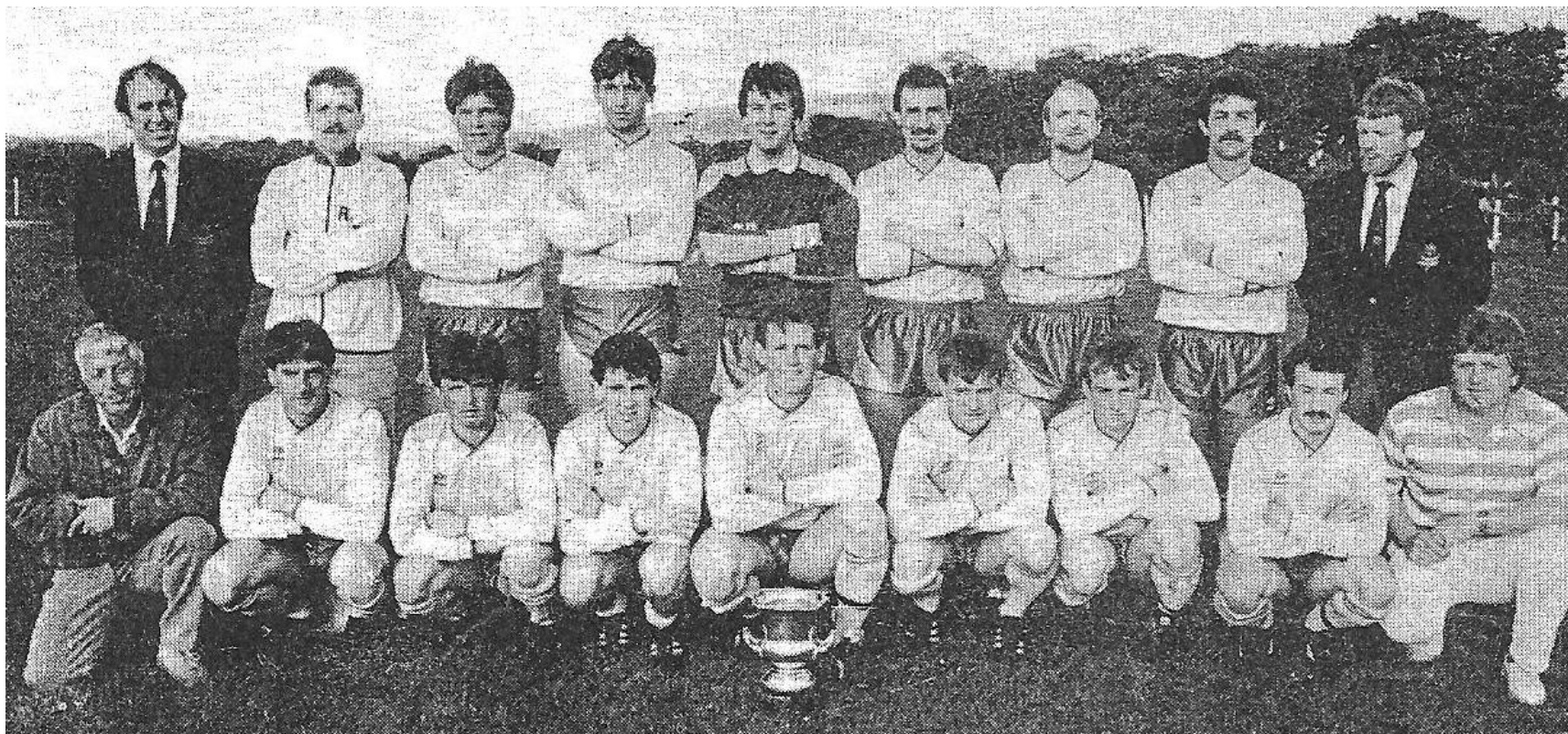
Intermediate League Champions 1987-88