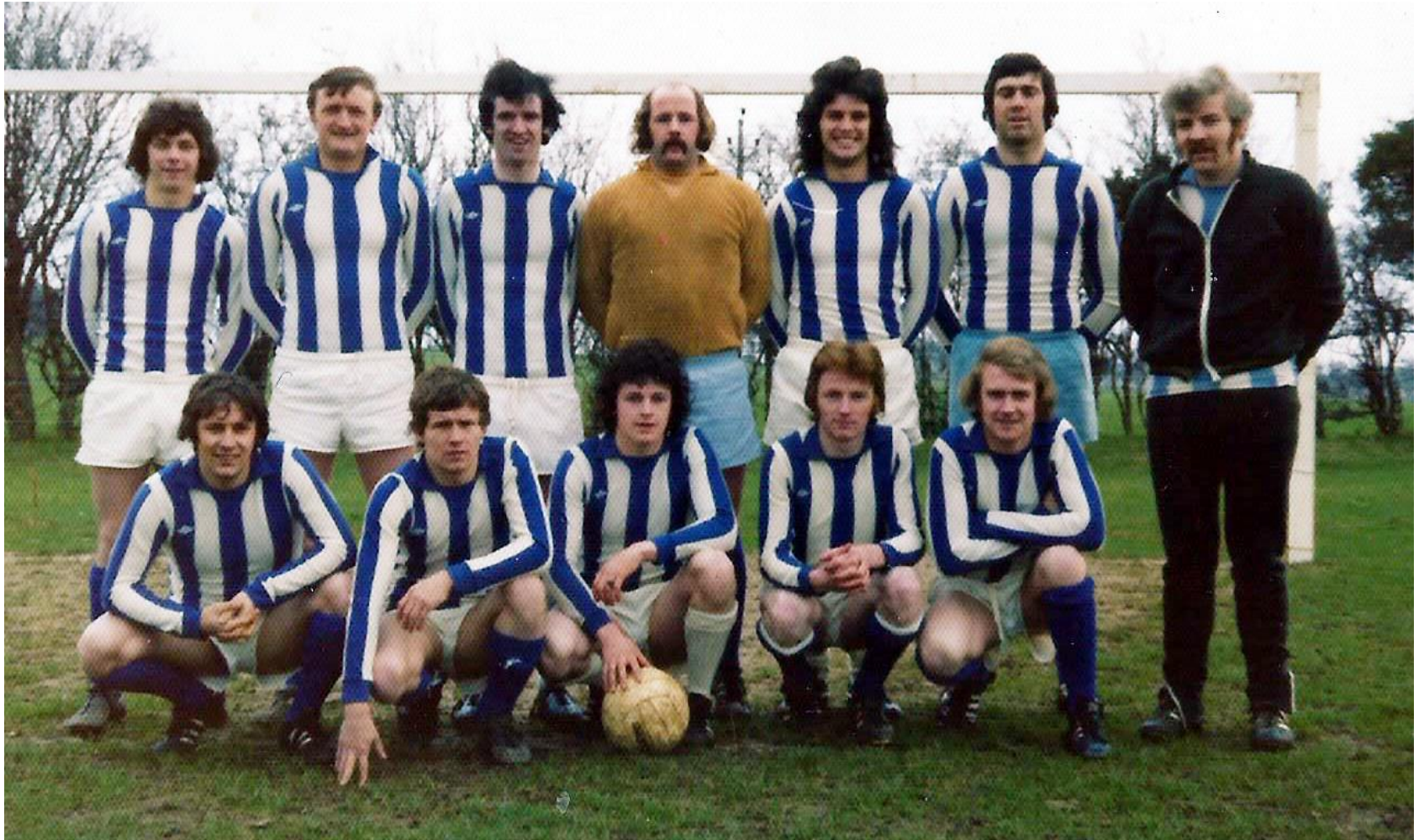
Roe Valley Reserves 1975-76