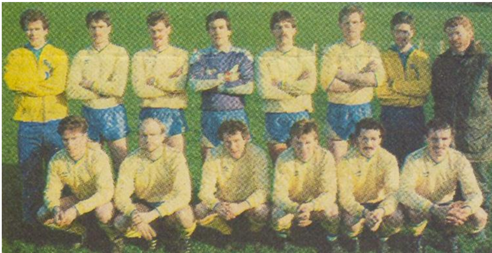
Roe Valley F.C. 1988-89