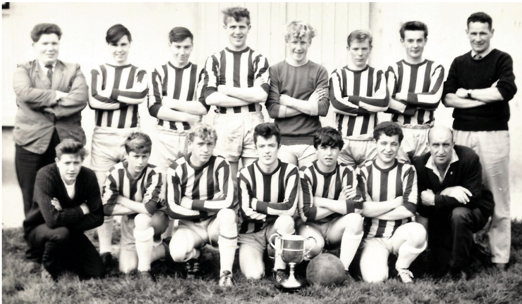
Roe Valley F.C. 1964. First ever team, it was an Under 18 side that played in the Coleraine & District Youth League winning it in their first attempt