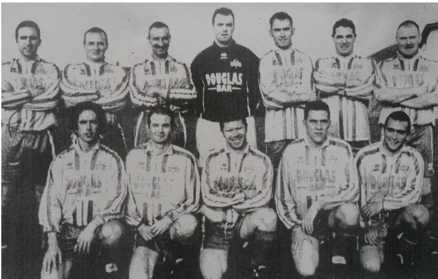
Roe Valley F.C. 1999