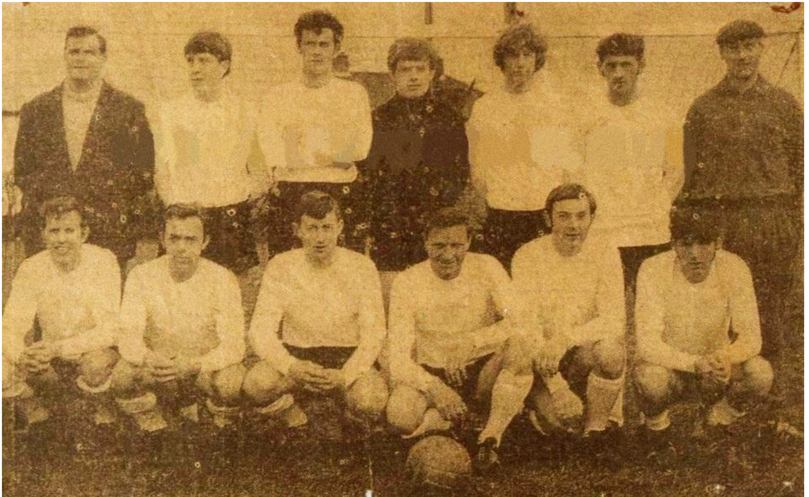
Roe Valley F.C. 1968