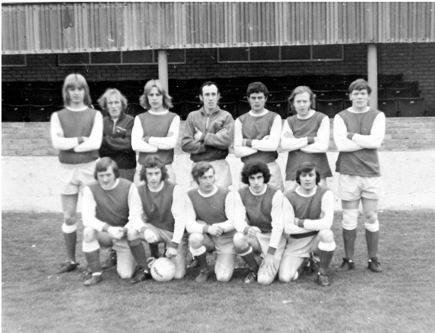
Roe Valley F.C. 1972 N.W. City Cup finalists, beaten by Coleraine Crusaders with the match being played at Coleraine Showgrounds