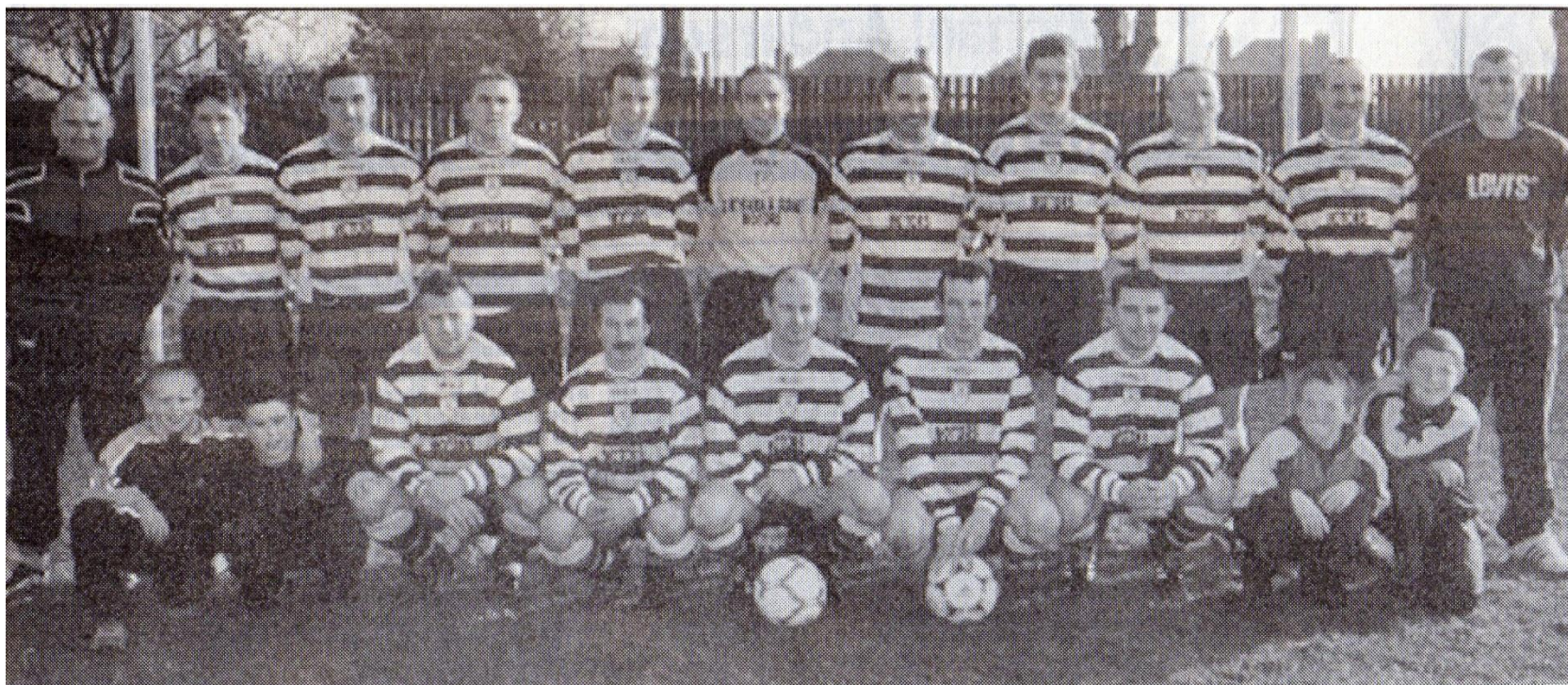
Roe Valley F.C. 2001