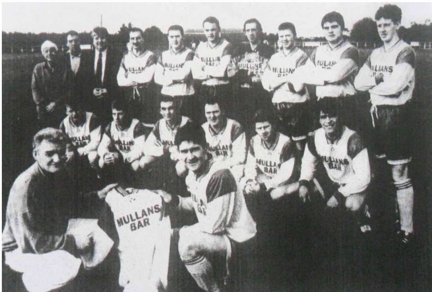
Roe Valley F.C. 1997