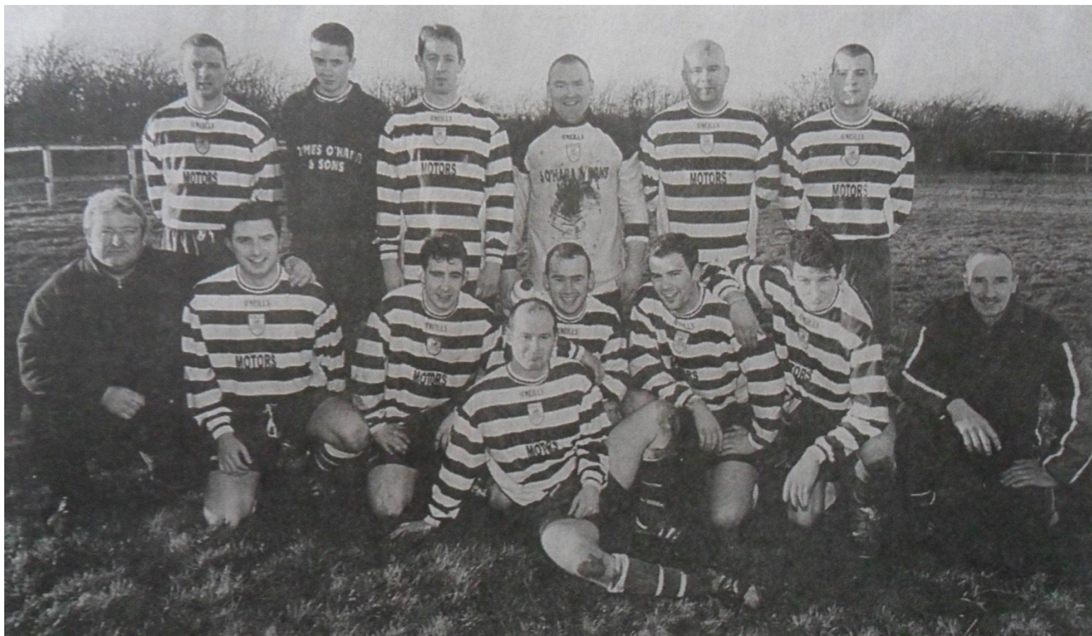
Roe Valley F.C. 2004