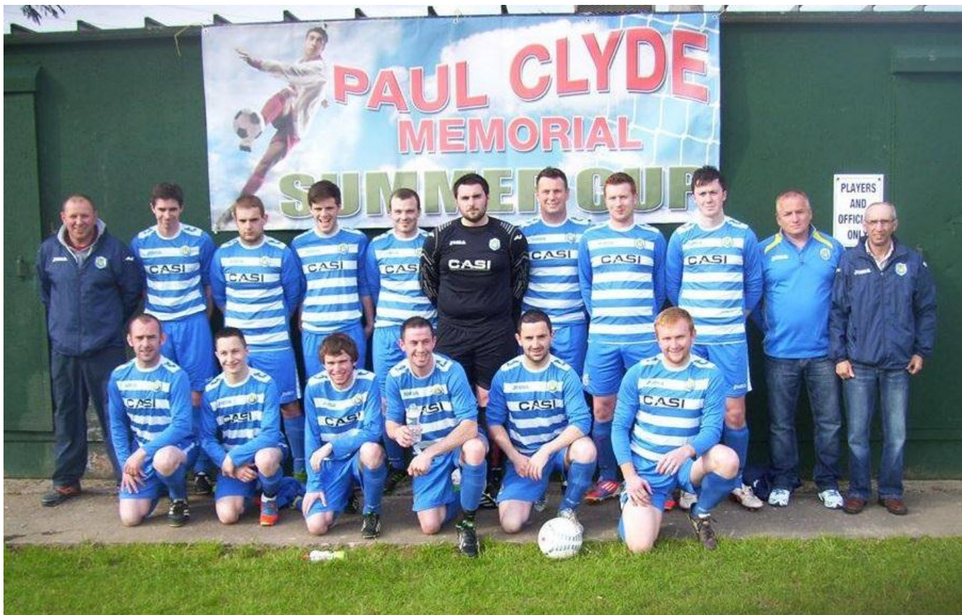
Roe Valley F.C. 2014-2015