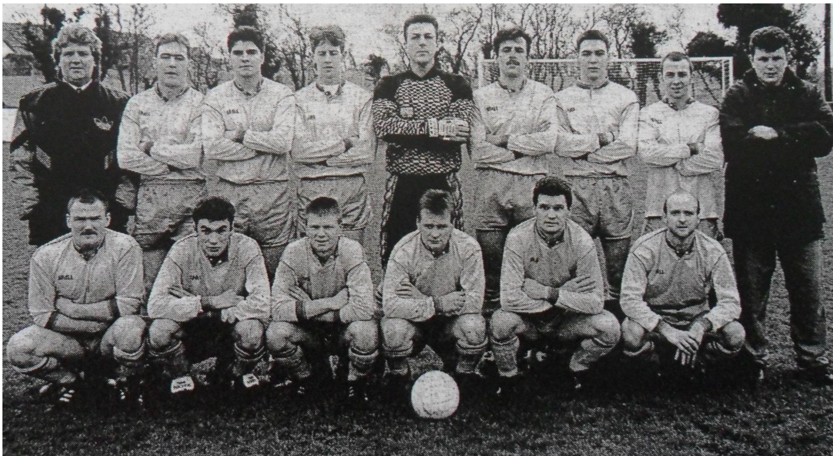
Roe Valley F.C. 1993-94