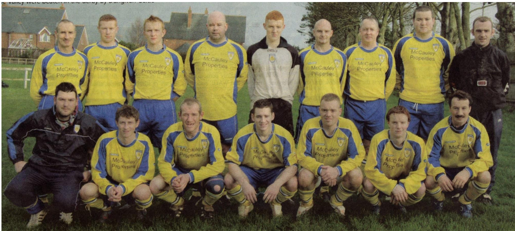
Roe Valley F.C. 2008