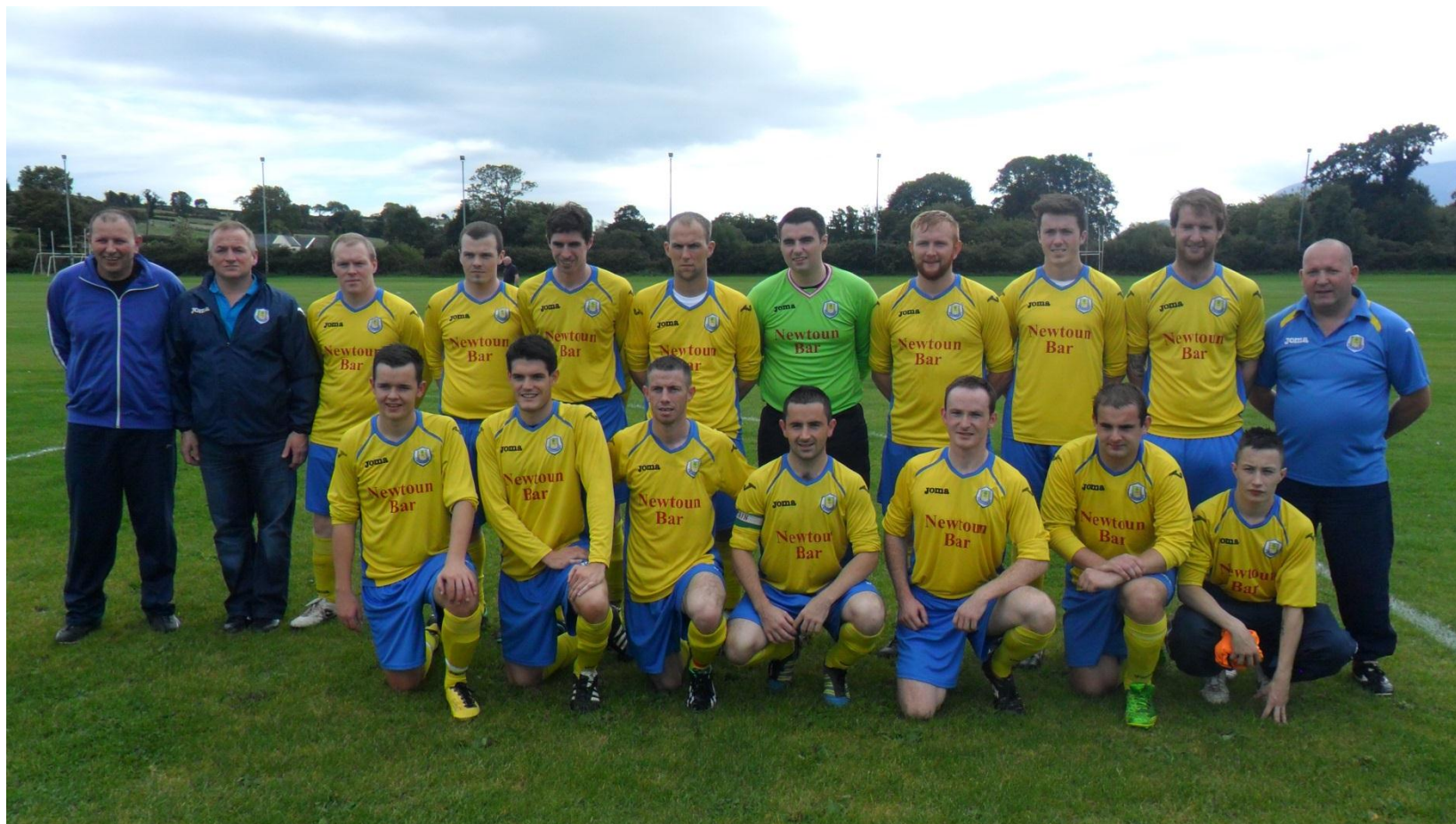
Roe Valley F.C. 2013-14