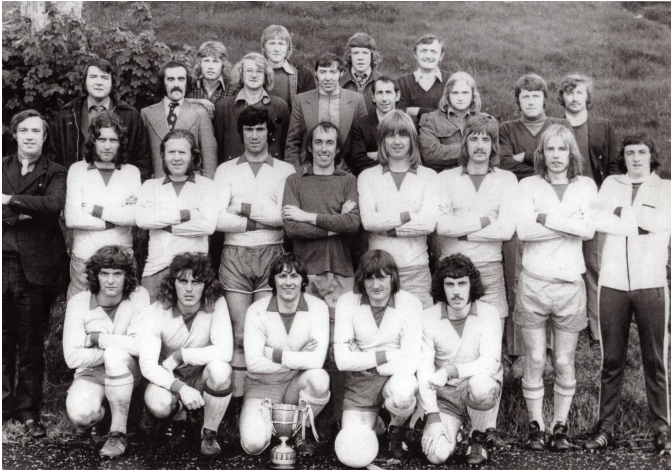
Roe Valley First and Reserve Team players photographed together before they played each other in the 1974-75 City Cup Final