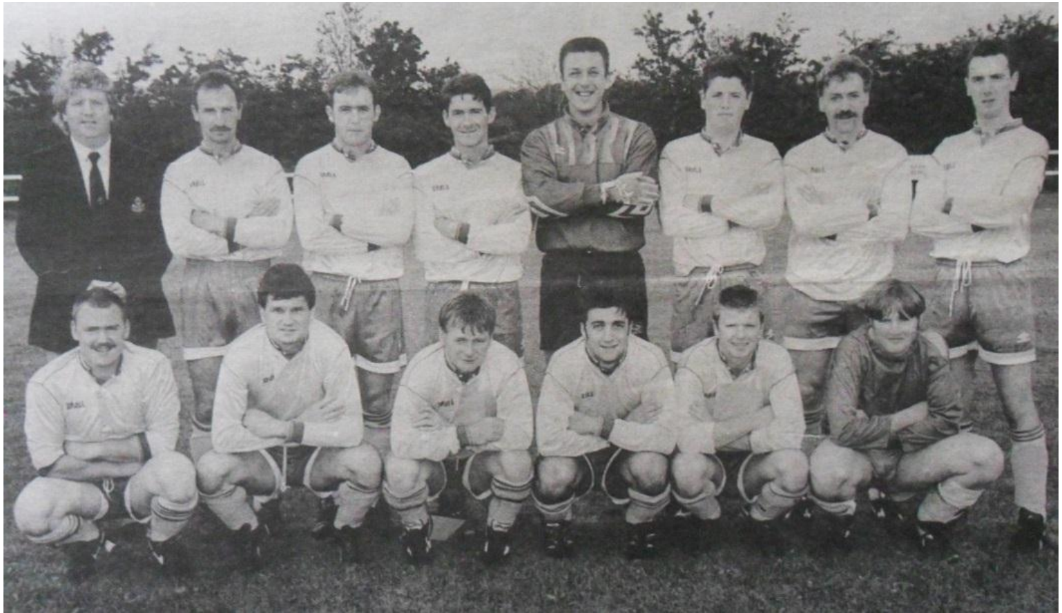
Roe Valley F.C. 1994-95