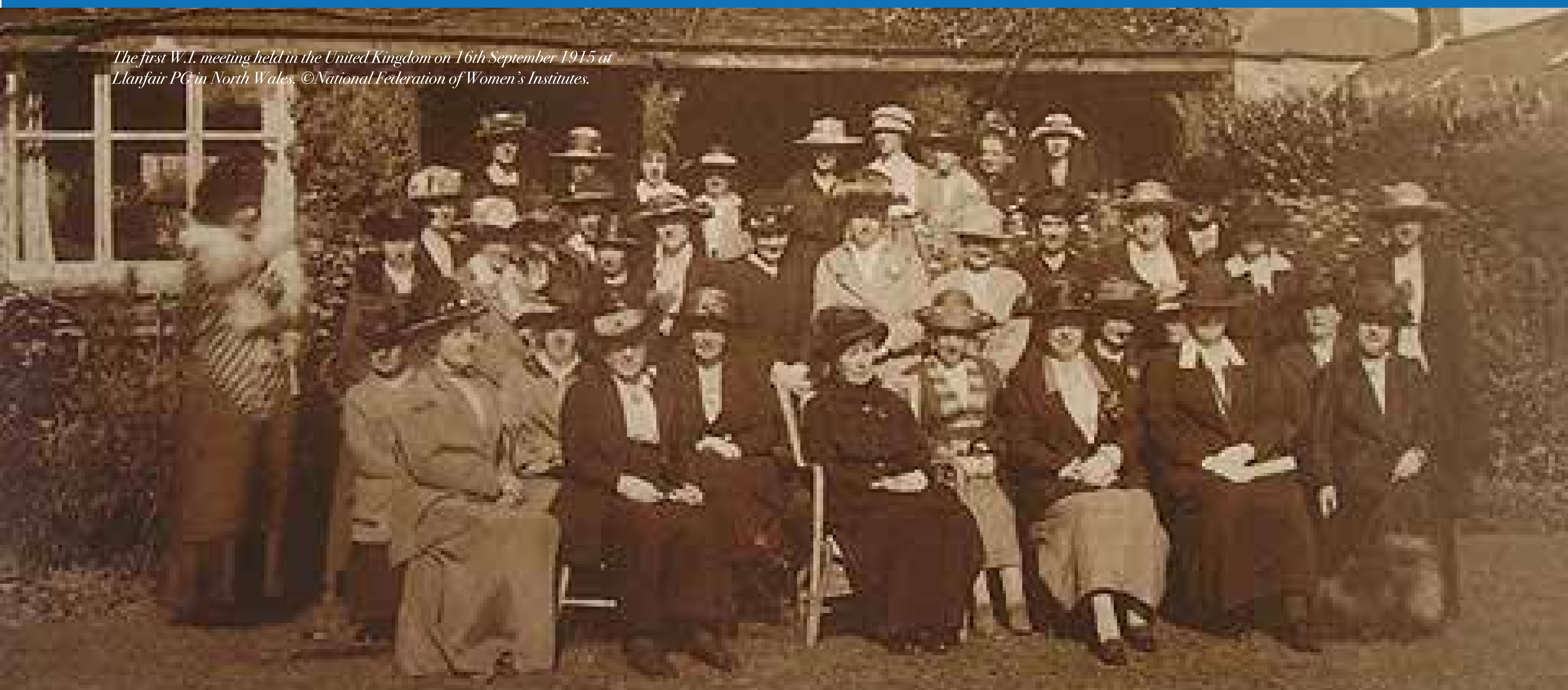
The first W.I. meeting held in the United Kingdom on 16th September 1915 at Llanfair PG in North Wales.