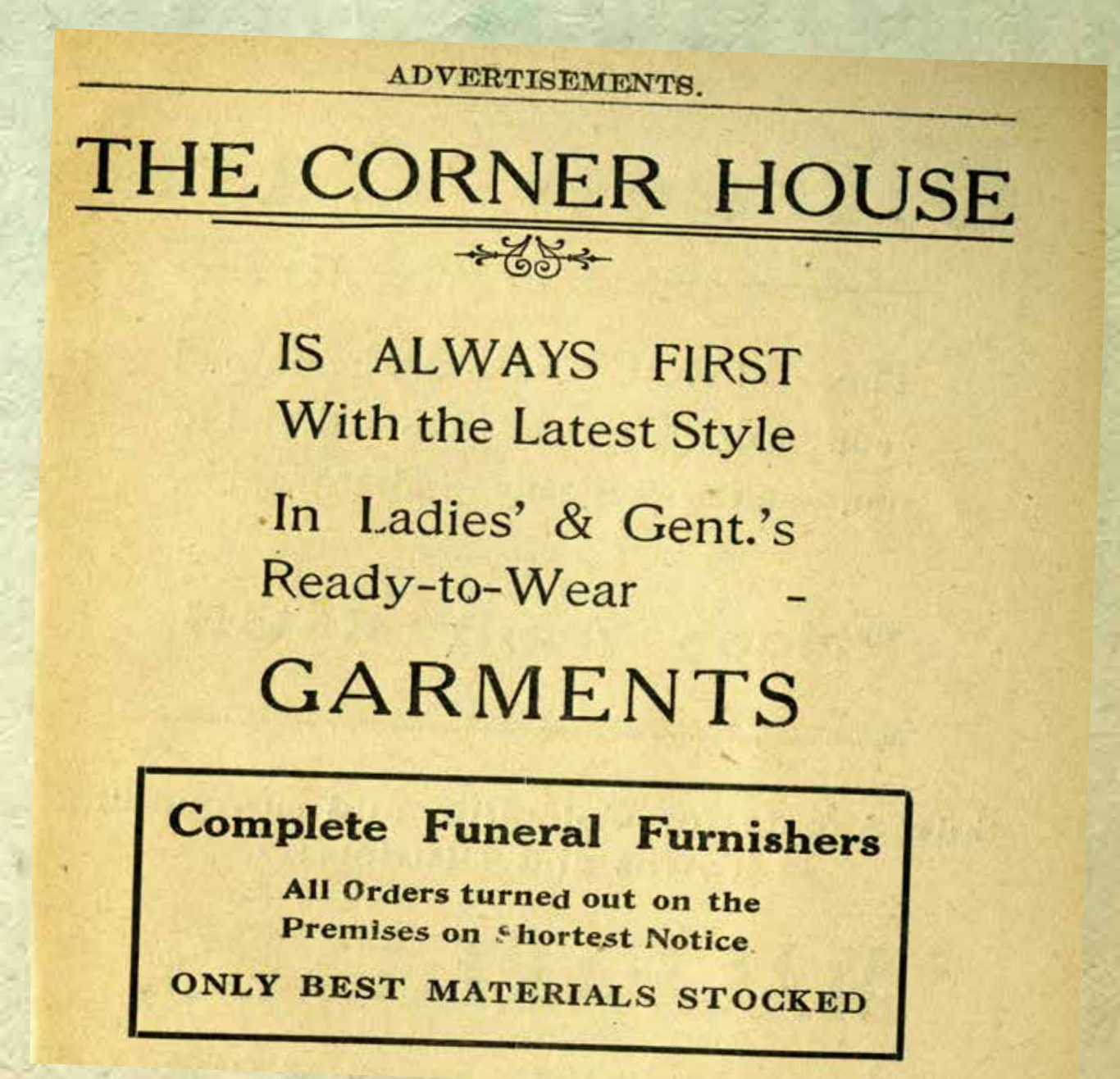
Advertisement printed in the Derry and Antrim yearbook, 1928 for The Corner House.