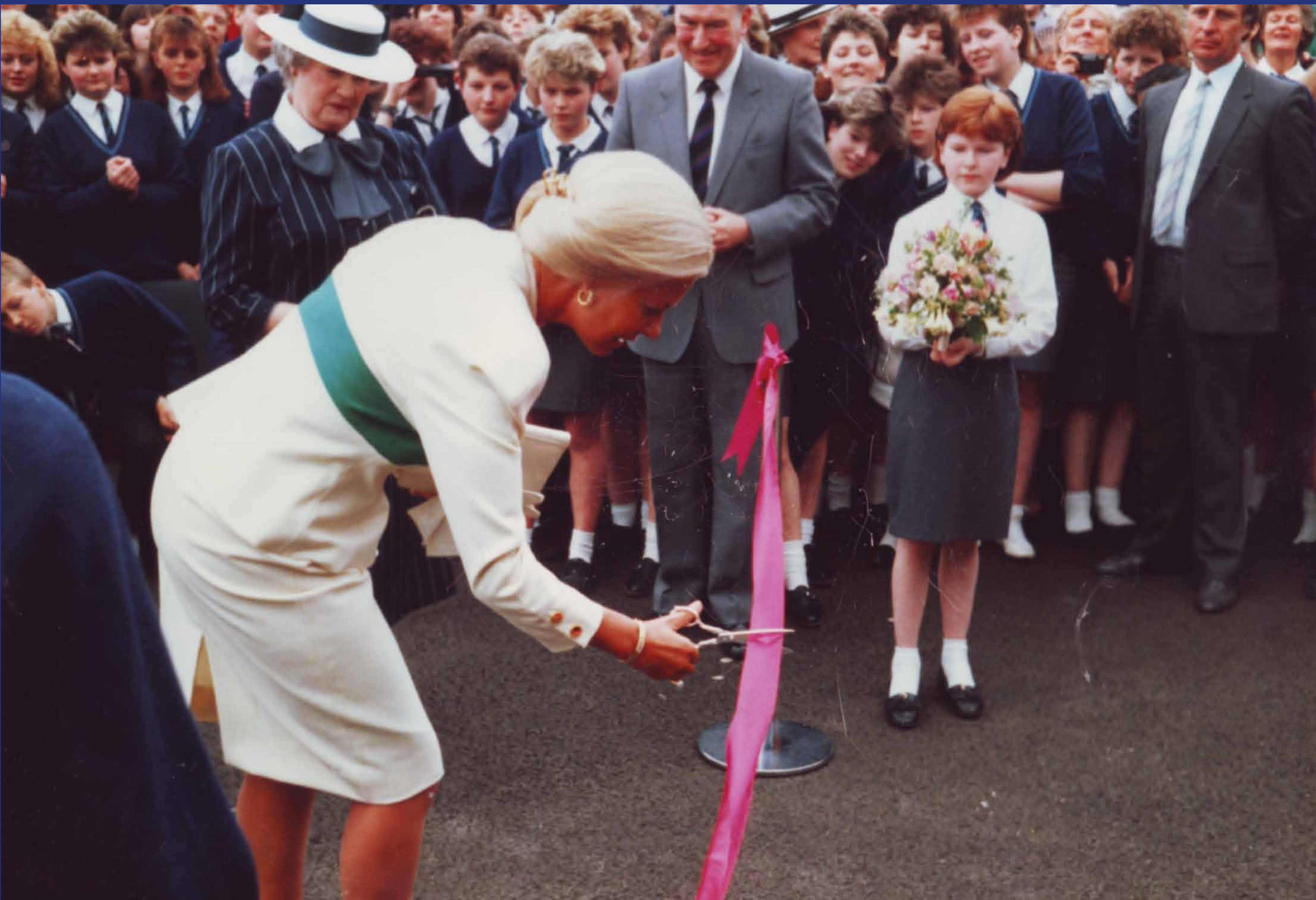
BELOW Duchess of Kent cutting the ribbon to the new extension