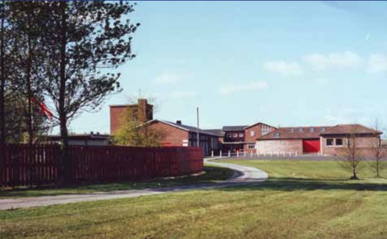
ABOVE A recent photograph of Ballymoney High School