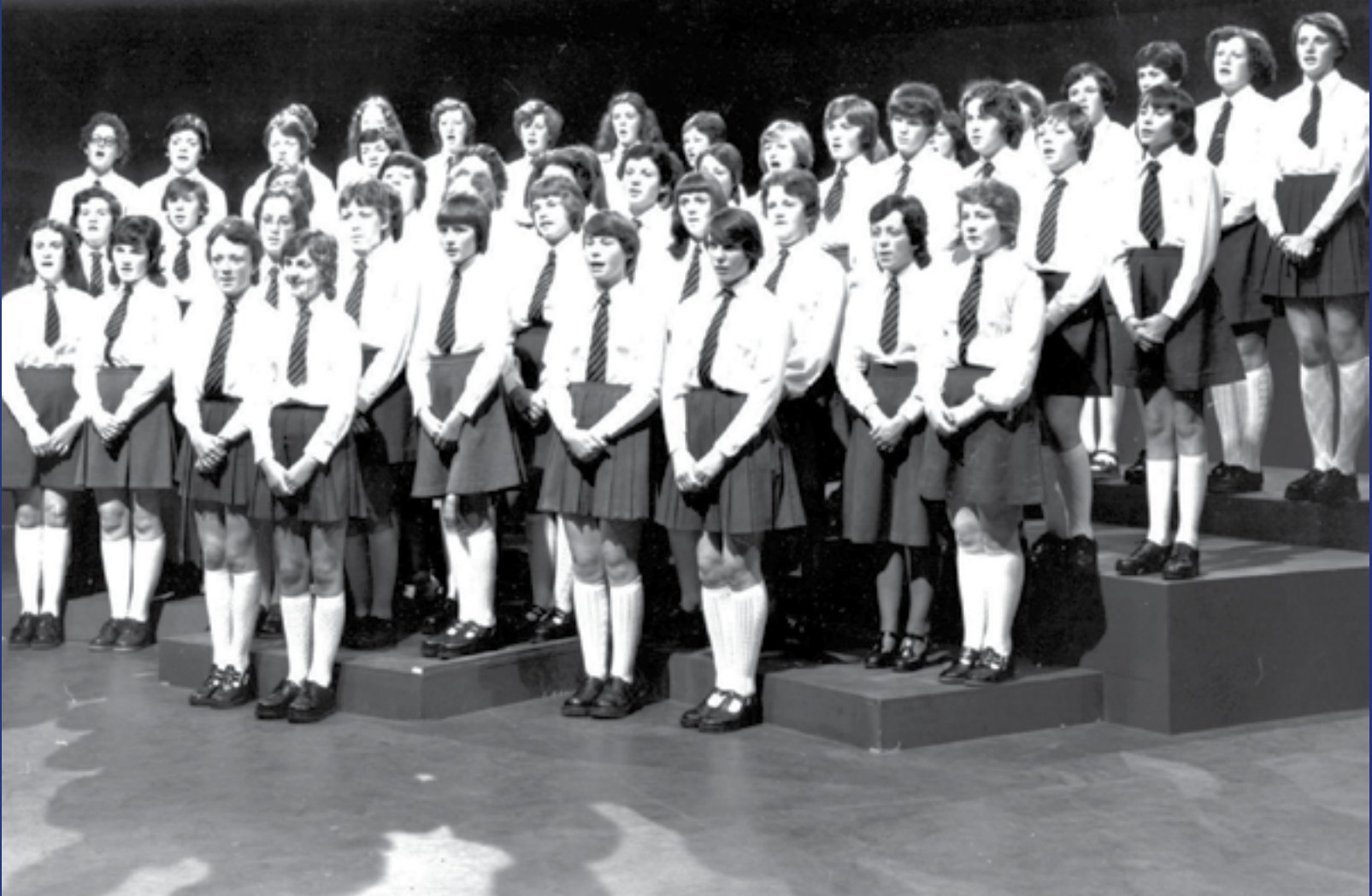
The choir practicing for their appearance on the television programme ‘Children and Their Music’