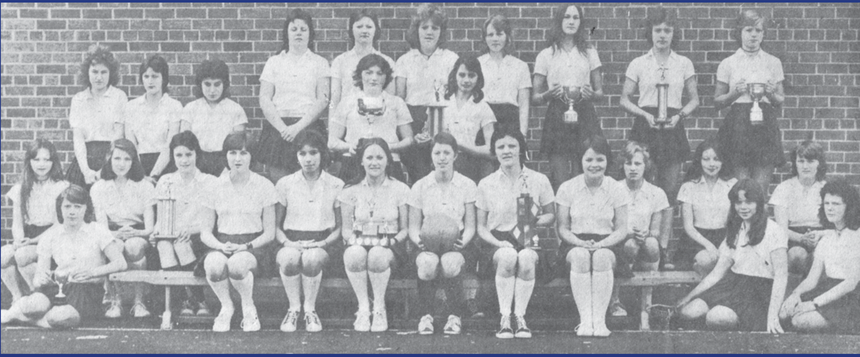
Combined netball teams of Ballymoney Secondary School with the trophies and cups won during a very successful season in 1976