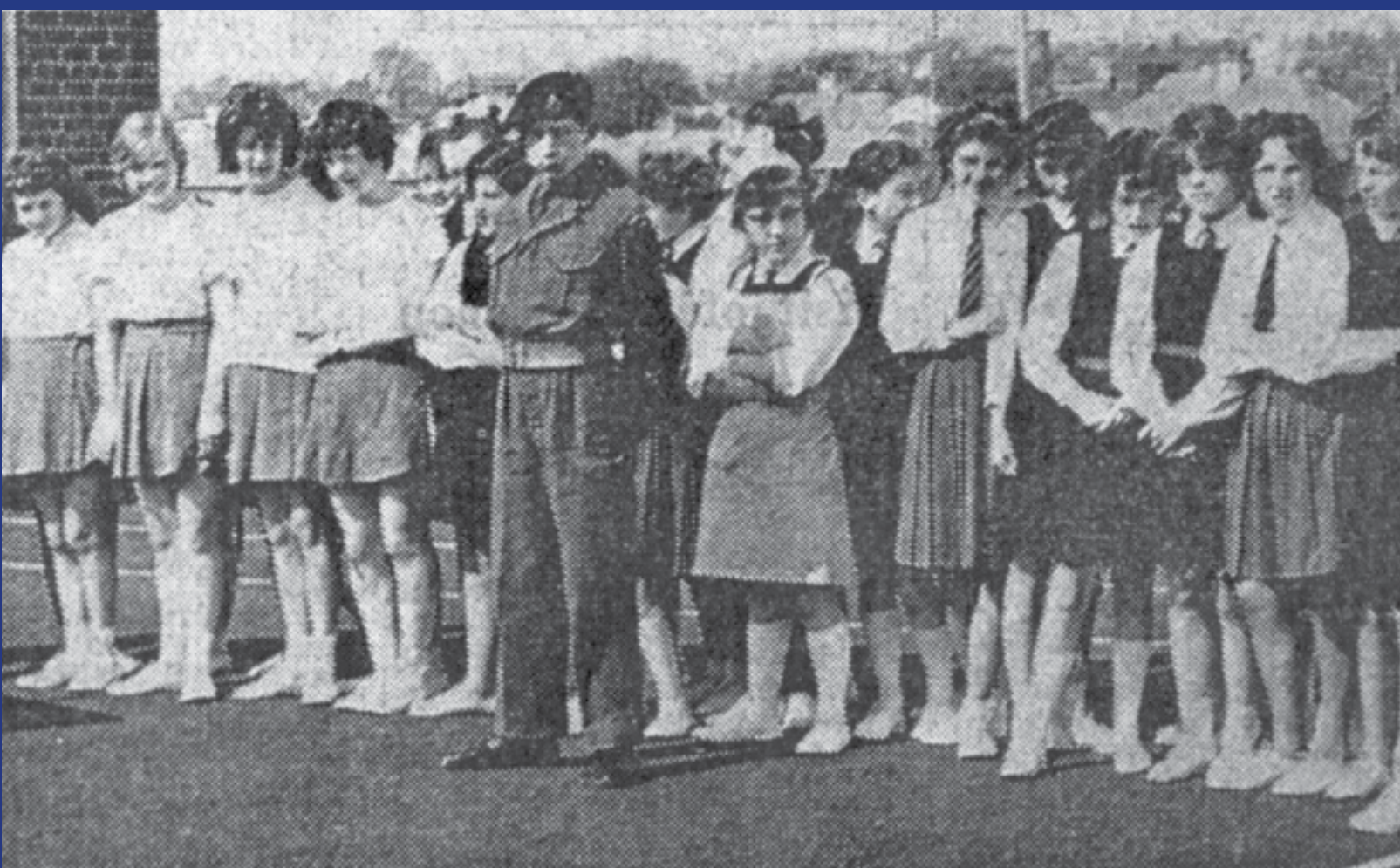
A group of pupils preparing to give the Prime Minister a rousing send-off after his tour of the then new Intermediate School

Breath-taking coastline cliffs reach down to the sea, White Rocks and Giant’s Causeway sights to see, Green fields are everywhere, farms nestle here and there, We have our song created, you we have long awaited, Cloudless the sky hangs overhead, Welcome to school this special day.