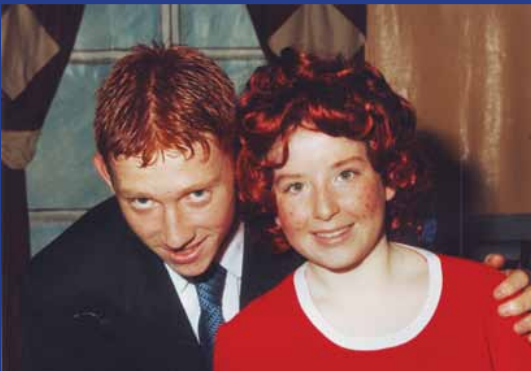
Cast members from the school production of Annie