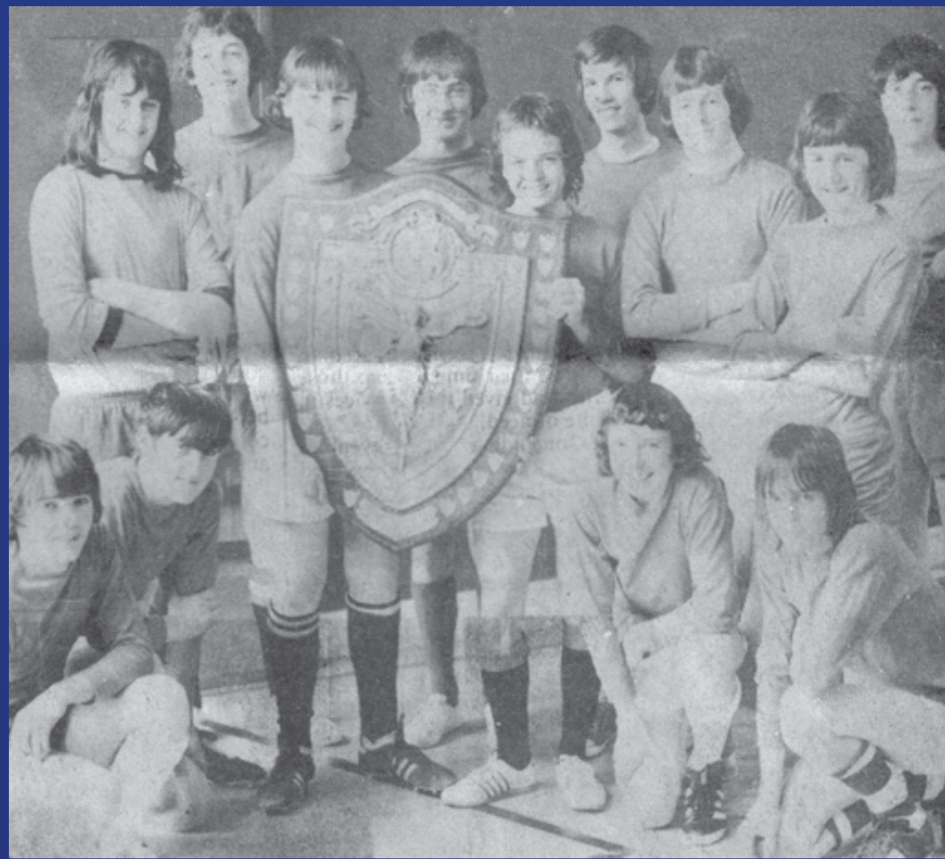
Soccer team which won the 1972 Irish Society Shield