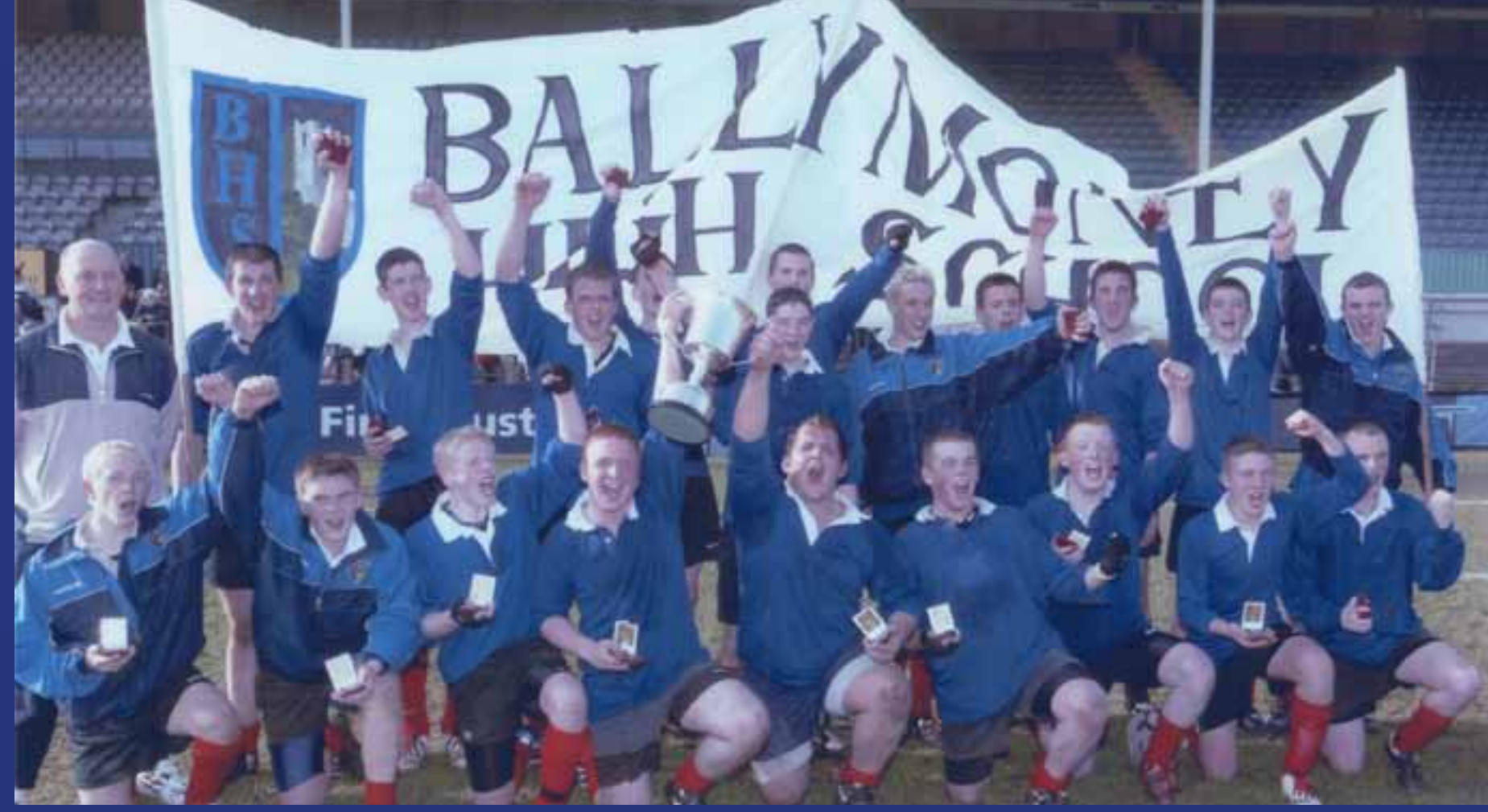
Under-16 rugby team, winners of the High Schools' Cup at Ravenhill, Belfast, 2003