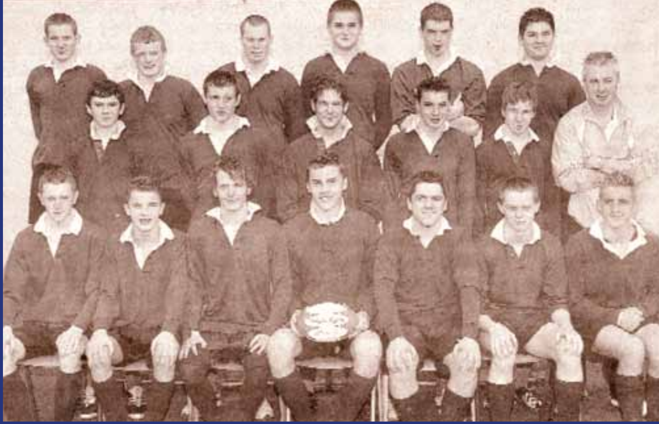
Year 12 rugby players, 2005