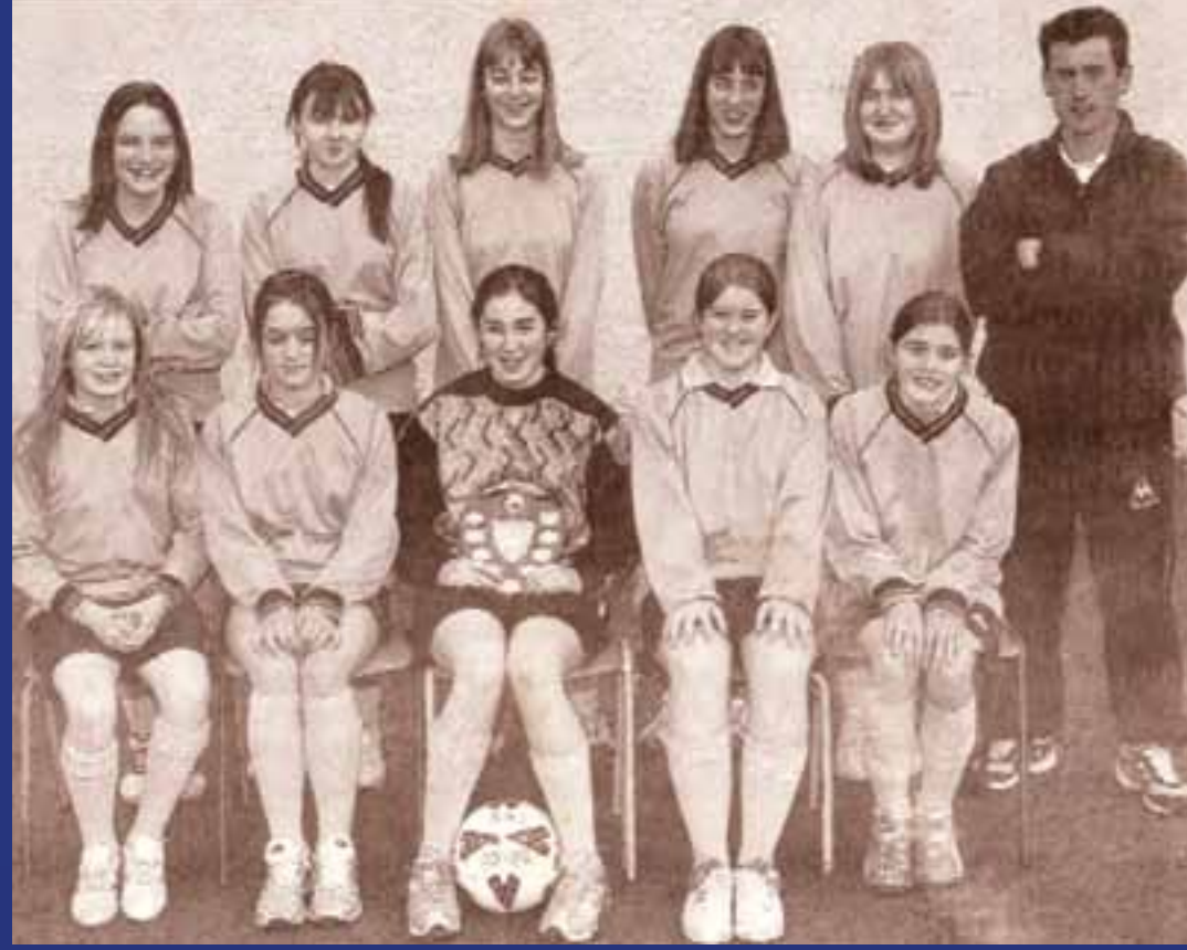
Girls' Under-14 soccer team, 2005