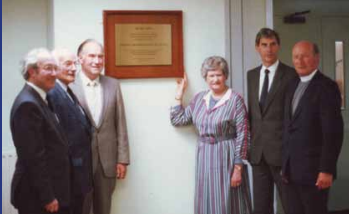
ABOVE The plaque to commemorate the opening of the Kent Wing extension.