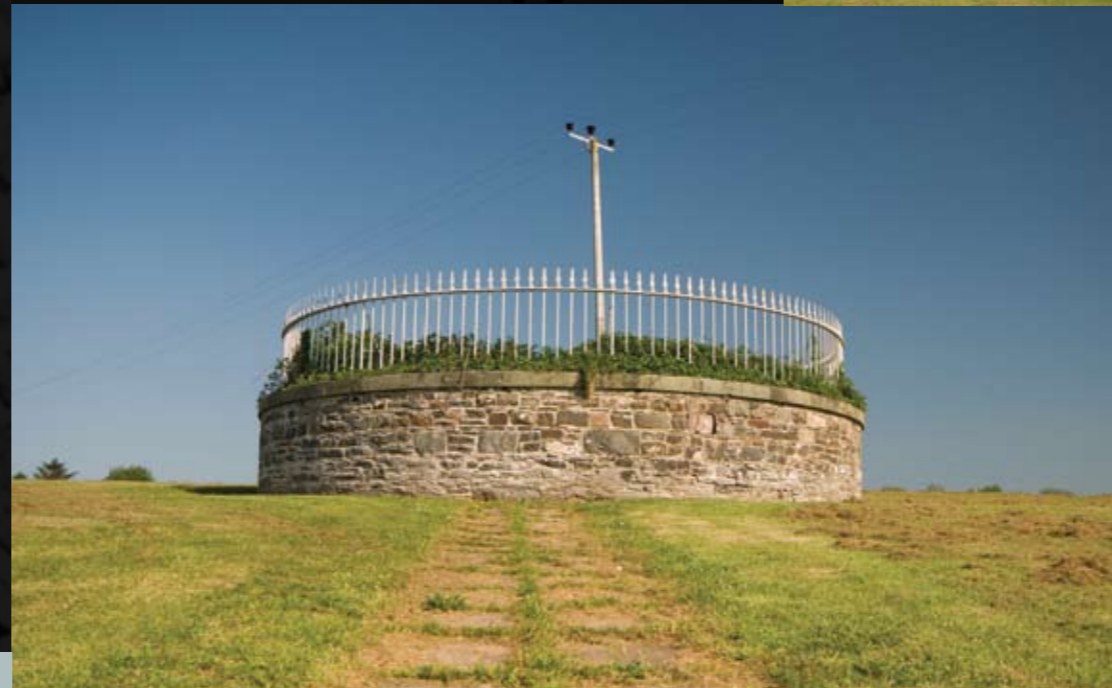
South Base Tower, Ballykelly

To preserve the baseline, the government acquired three base towers that can still be seen today. A fourth base tower was situated at Mountsandy, but has since been claimed by the sea.