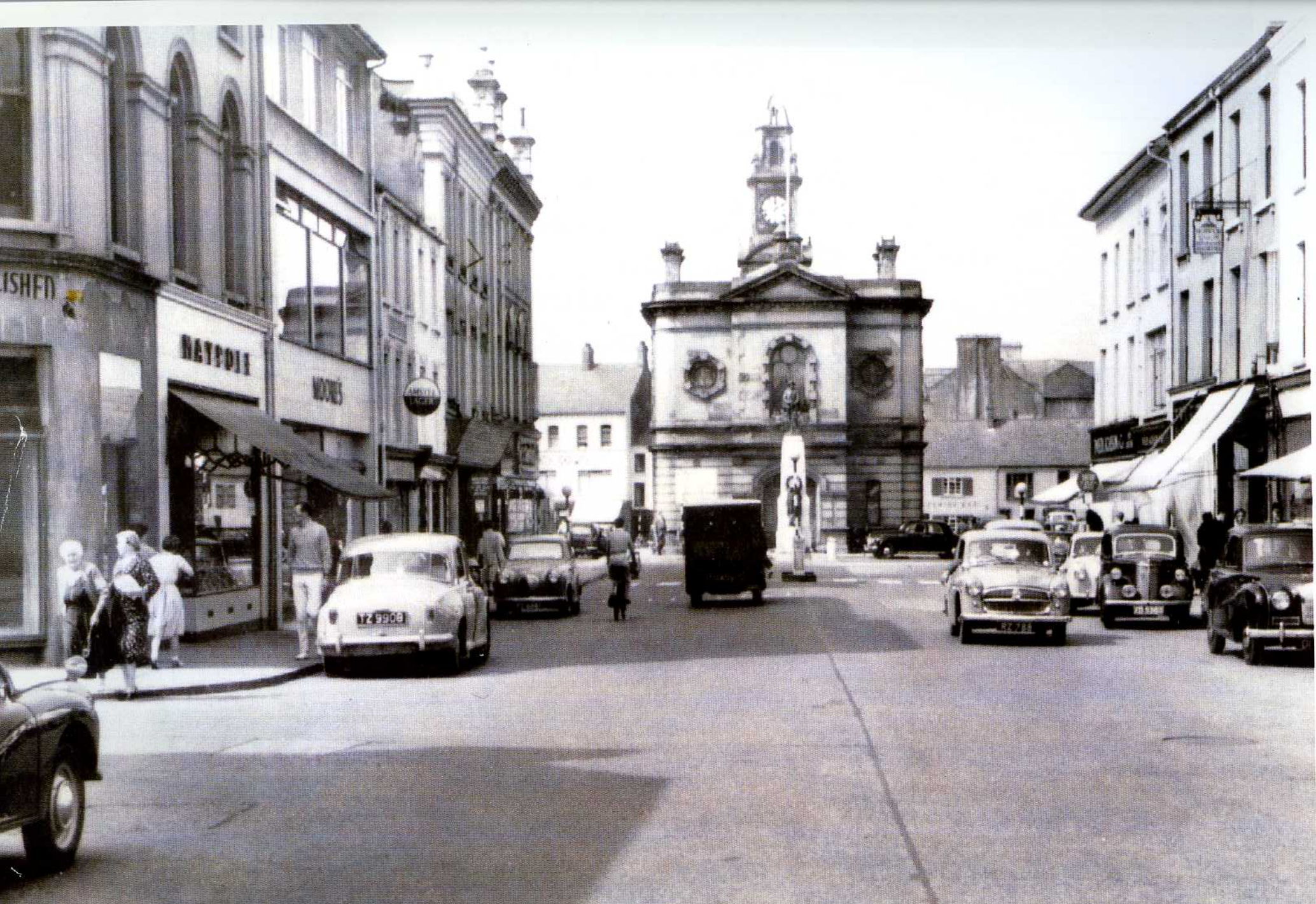
CHURCH STREET, COLERAINE, CO. DERRY