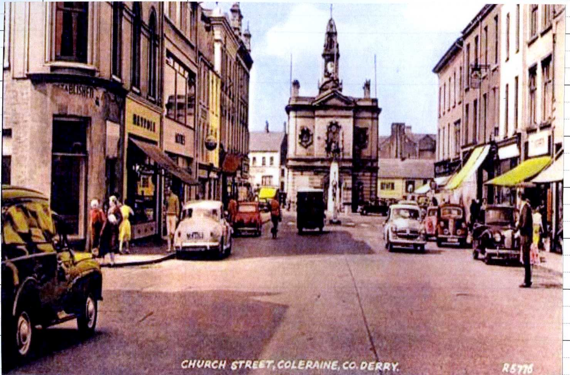
CHURCH STREET, COLERAINE, CO. DERRY.